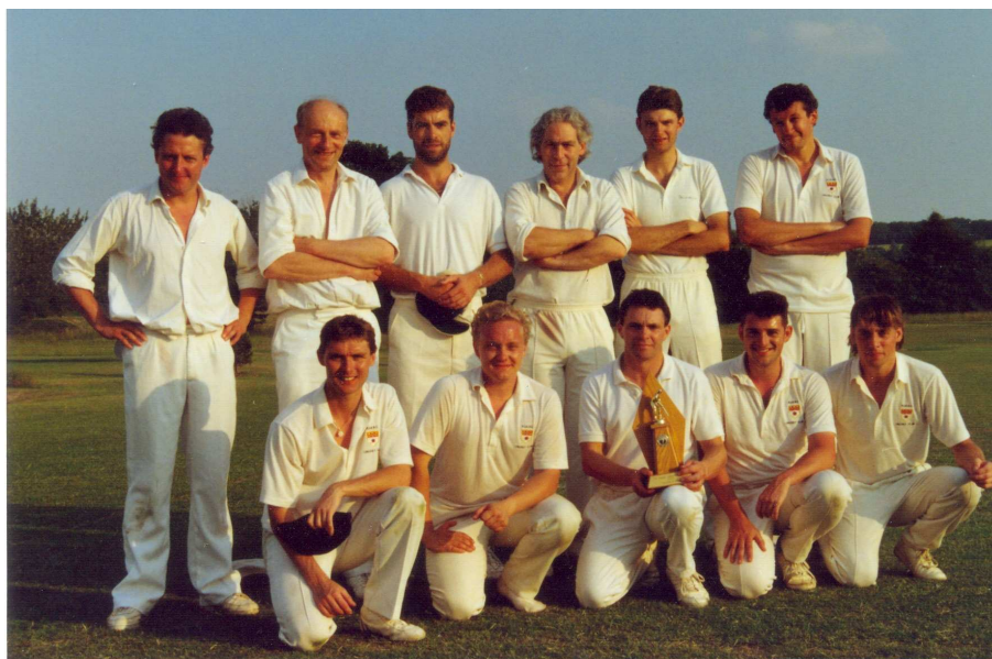
Figure 7: RUASCC winners of the Sir George Edwards Trophy at Guildford 1990