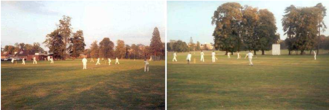
Figure 2: Back Pitch at Elmhurst Road 1985

brick wall, and a Public Enquiry was held, but the objections were overruled. The Planning Inspector who chaired the Enquiry made it clear that cricket was an irrelevant consideration, notwithstanding the “village green” atmosphere which was referred to. So one sports facility was replaced by a different one in 1985. [The grounds at Bulmershe, and between Queen’s Drive and Chancellor’s Drive, both suffer from wide exposure, distant changing facilities, and pitches which can be dangerous].