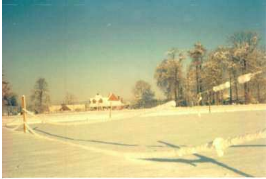
Figure 4: Main Pitch at Elmshurst Road in February 1981

himself of the possible ambiguity of such plaudits.