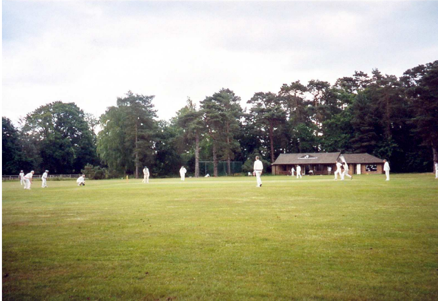
Figure 1: Farley Hill ground

Fielders have to be aware of holes scraped by rabbits, especially nearer the woods. Visibility against dark trees is not always easy: witness the occasion, many years ago, when an off drive towards the paddock sent Bob Pearce, fielding at long off, scurrying in the opposite direction to the line of the ball, prompting a chorus of “The other way, Bob” from several fielders facing that way.