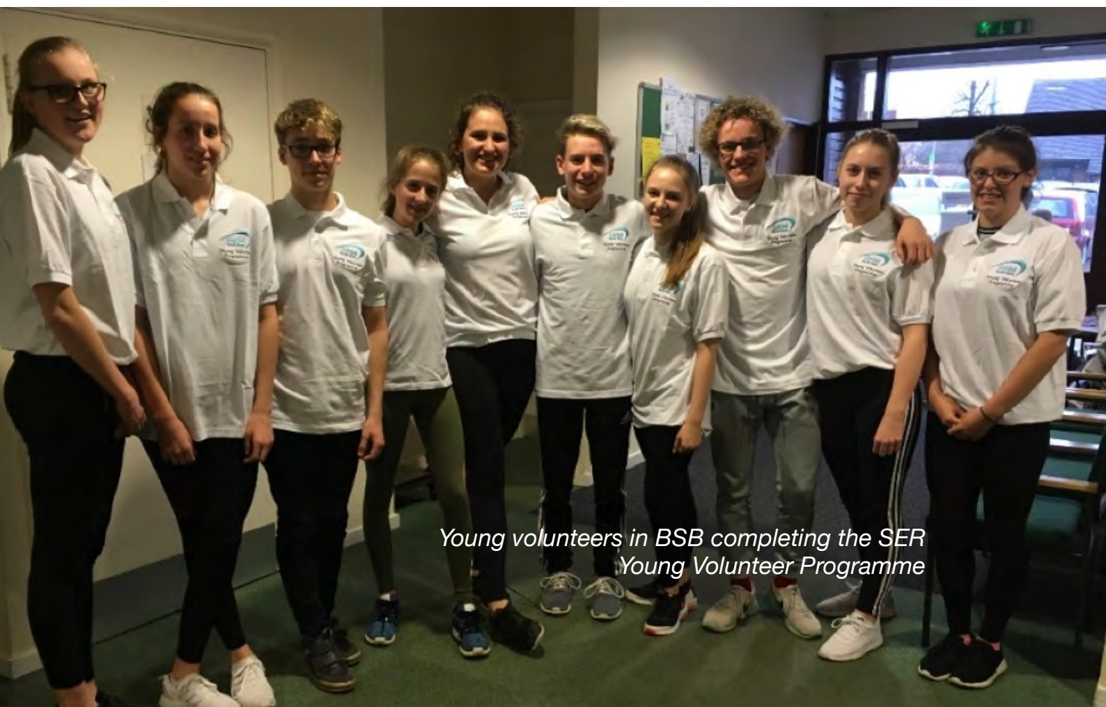
Young volunteers in BSB completing the SER Young Volunteer Programme

The aim of the SER Young Volunteer Programme is to increase the number of trained young people and to improve the accessibility to formal and informal training opportunities. Young people participating in the programme were expected to attend two Development Days, one between September – December 2016 and the second in February / March