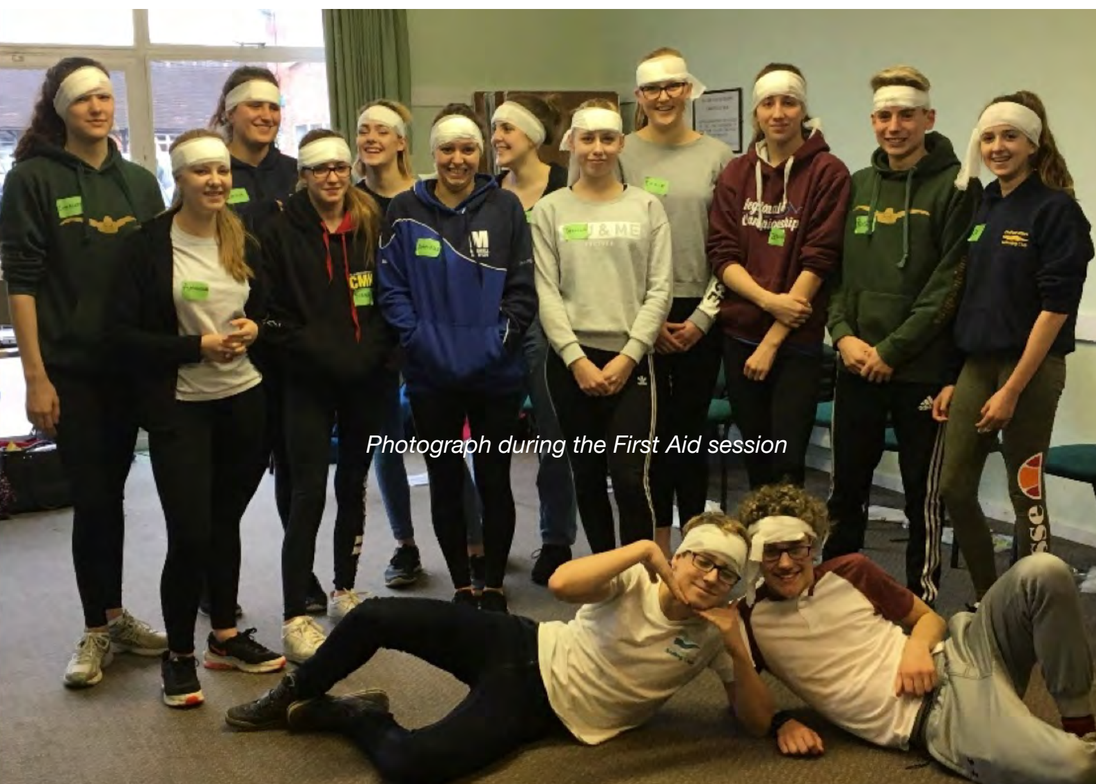
Photograph during the First Aid session