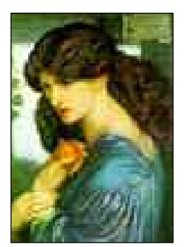
• Persephone by Dante Gabriel Rossetti, 1874) London)

the underworld, of dead heading plants and collecting debris, of protecting shrubs and young trees from voracious deer and from starving rabbits that find nooks and crannies for breeding in early spring if waste is left to rot in piles.