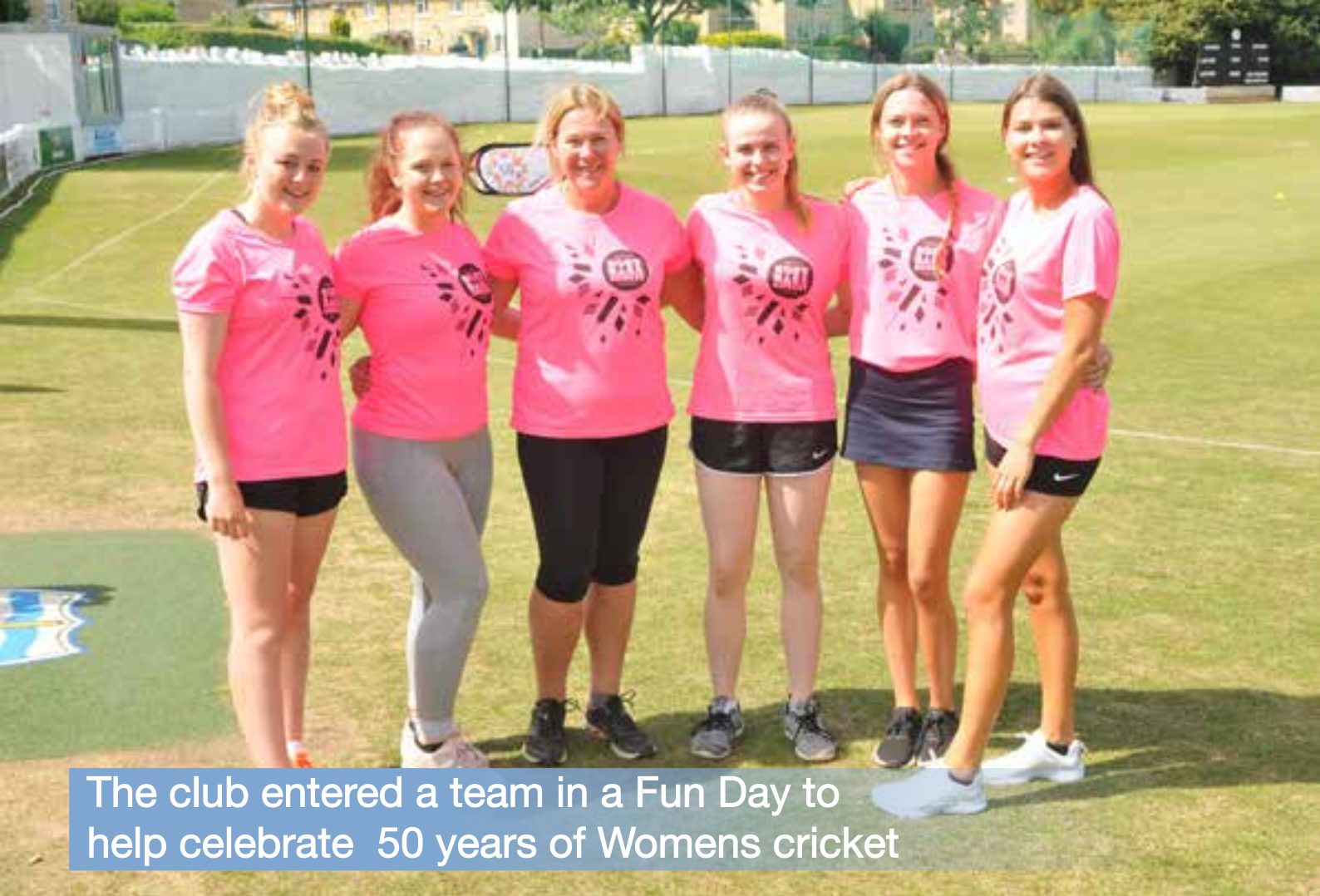
The club entered a team in a Fun Day to help celebrate 50 years of Womens cricket