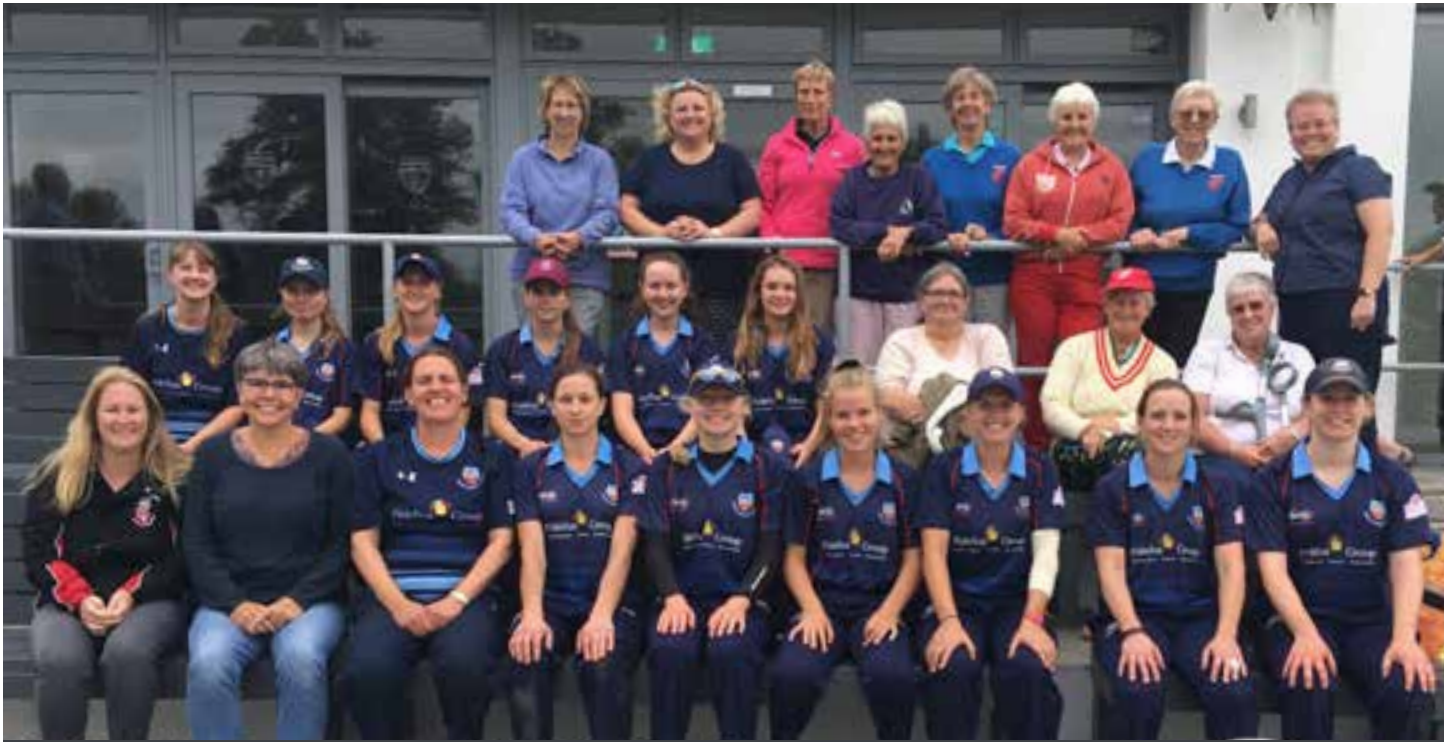
Bath Wanderers celebrated 50 years of cricket with a gathering of ex-players