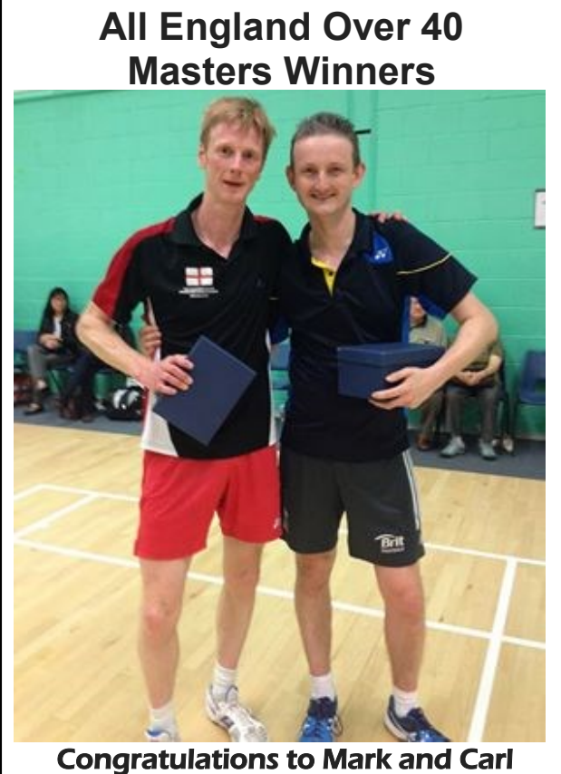
What an achievement!

already mentioned we believe we have the coaches to help players achieve their potential, so what is left? Buy in from players and parents. In the coming months at the end of the season and during the summer we will be putting together a programme for next year that focuses on