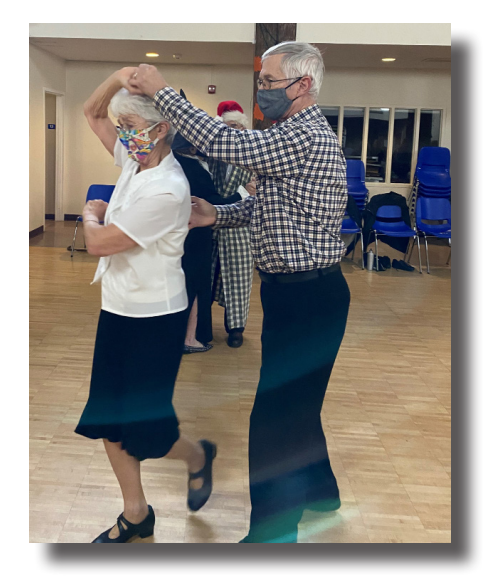
BSAC will be closed on: Wednesday, Aug. 3 (Senior Day in the Park)

Our mission is to offer a wide range of classes, activities and services for persons 50 years of age and over to encourage emotional, mental, and physical wellness for a healthy, active, and independent lifestyle.