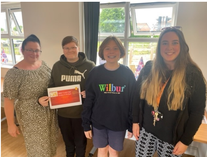
4 the Youth (pictured above)