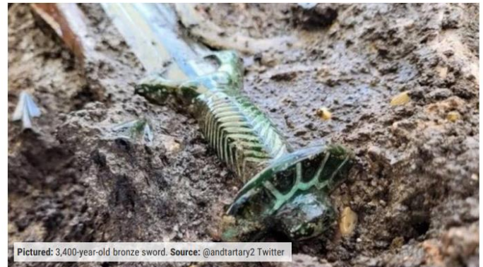
Pictured: 3,400-year-old bronze sword.