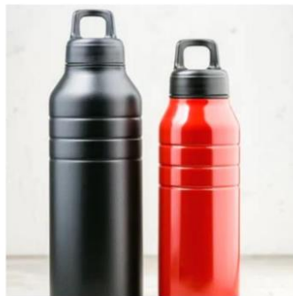
Pictured: Refillable water bottles.

The UK is embracing refillable water bottles and asking for a water top up has become a regular occurrence. According to a poll by Refill, an app that maps venues offering refills, around 60 per cent of people living in the UK now carry a reusable bottle. This is compared with just 20 per cent eight years ago. Steve Hynd, policy manager at City to Sea, a plastics pollution charity that runs the app, said, 'It always used to be that slightly awkward moment of asking to have your water bottle refilled - but now it's the norm.'