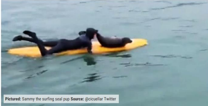
Pictured: Sammy the surfing seal pup

Surfers in San Diego received a surprise when they were joined by a seal pup! Typically, seals steer clear of humans but not this baby seal! It was abnormally friendly and appeared unafraid as it proceeded to move from surfboard to surfboard, catching the waves. SeaWorld was notified and sent an expert crew out to check on the animal. Releasing a statement, SeaWorld officials reported, 'There was no need to intervene as the pup