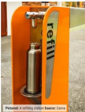
Pictured: A refilling station

Water bottle brands continue to develop and make purchasing one more desirable. Chilly's have produced robust and heat-resistant water bottles and Air Up created the world's first bottle that flavours water using scent. Although progress has been made, there is still a lot of work to do to eliminate single-use plastic water bottles. The UK alone disposes of 10 million bottles each day!