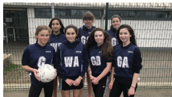
Y9B Netball Team