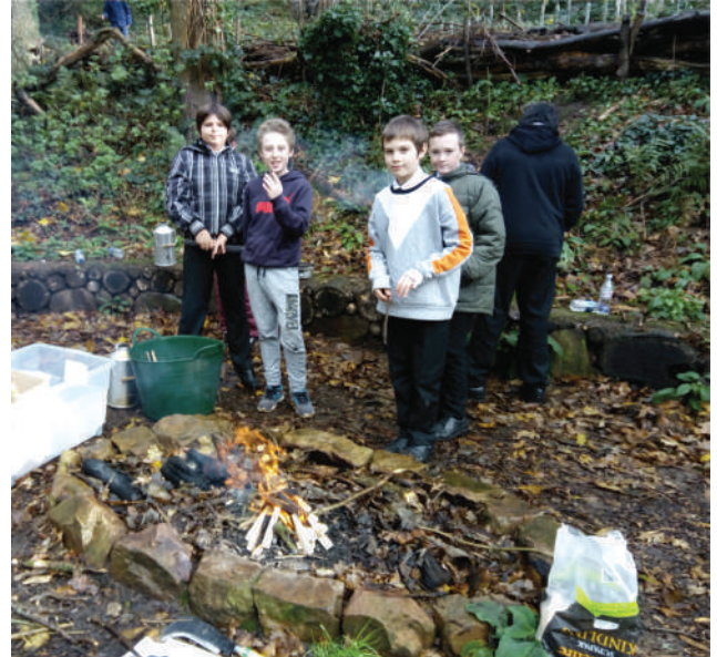
Y7 wellbeing group

Some of the most rewarding work is the one to one support work we offer students. Students who would benefit from support are identified by school and we build an individual programme for them. This can be practical work, a set programme or just an opportunity to talk through different issues.