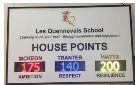
The new House Points scoreboard

We must also give a huge thumbs up for the new House scoreboard. Anyone going into the hall can't fail to have noticed the massive neon board proudly displaying the scores. Who will end up on top? It's over to you!