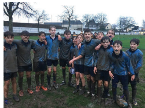
A very muddy Y9 Rugby Team