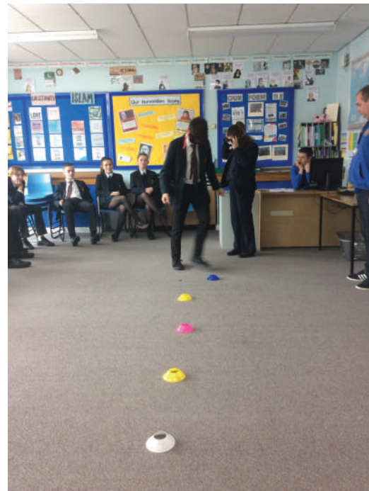
Students learning about beer goggles

The Summer term promises to be just as busy and productive, and hopefully the students are gaining a great deal from their lessons and workshops.