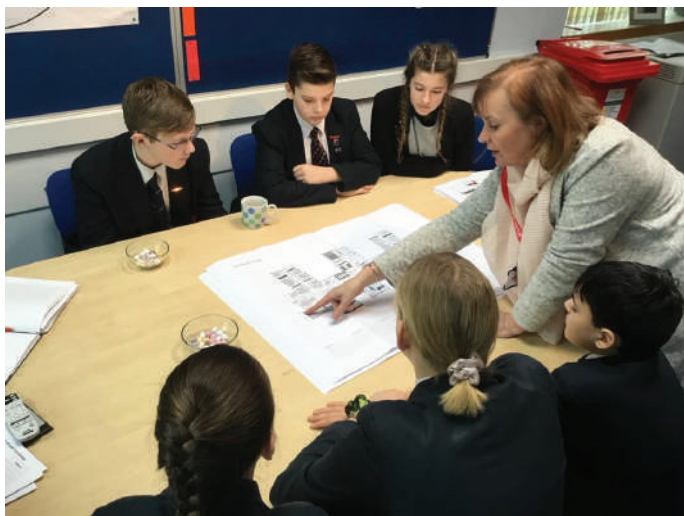
Lead student design team look over the plans

You will have seen and shared our dismay at the news that the purchase of some of the land required to begin building the new school has been delayed and a Compulsory Purchased Order may be required to allow things to progress. We have been reassured that the process will be completed as soon as possible this year but hopefully agreement with the current land owner can be resolved earlier. As a school we are disappointed in any delay in getting our students and staff into a new and more fit for purpose building and we encourage all parties involved to seek a solution to allow building to start as soon as possible. To be delayed a further year denies our students a further year of access to the outstanding building we are designing. So much outstanding teaching and learning is taking place in the existing building and moving to an outstanding new building can only enhance this and allow our staff and students to really fly.