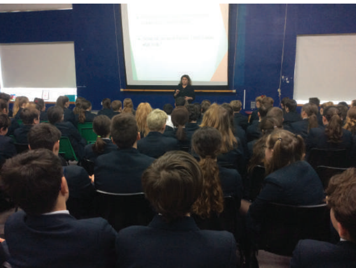
RAP project talking to students about online safety and body image