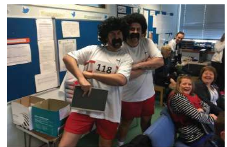
DT team's 118 runners!

I would like to extend my thank you to everyone involved, and congratulate the school on raising a whopping £1,928.00 for Sport Relief.