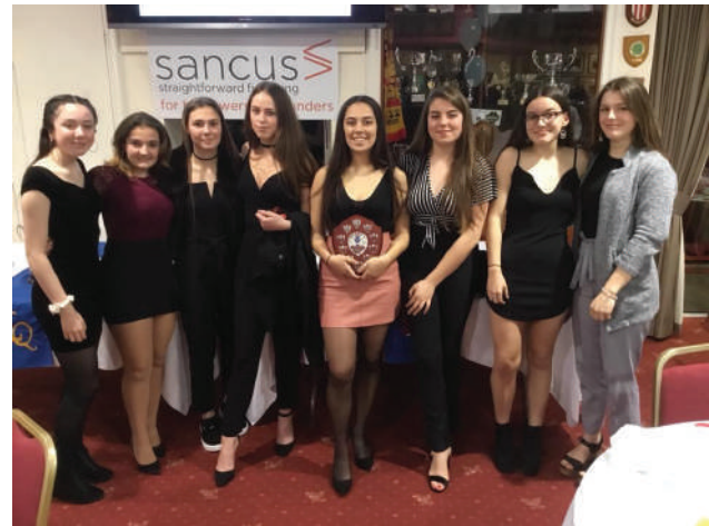
Y11 Netball team win Girls Team of the Year