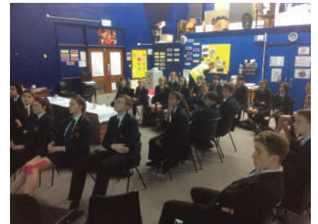
Student parliament look at plans for the new build

We hope to have a small team of Les Quennevais students who will contribute to this exciting opportunity.