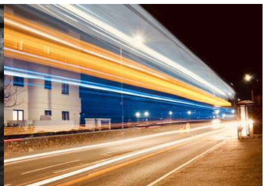
Ethan Double, Platinum

As I write this, we are in the midst of judging our 'Next Top Photographer' knock out competition. We have been blown away with the quantity and quality of entries for this new competition.