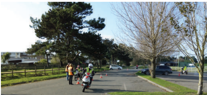
Students learning to ride motorcycles safely

Being in school so often and working alongside staff and students means we are able to link young people up to the services and opportunities best suited to them.