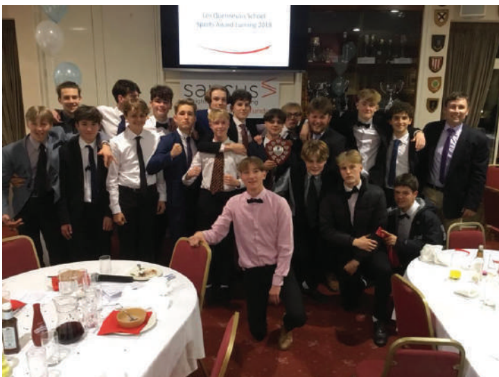
Y11 Football Champions win Boys Team of the Year