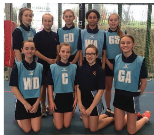
Y8A Netball Team