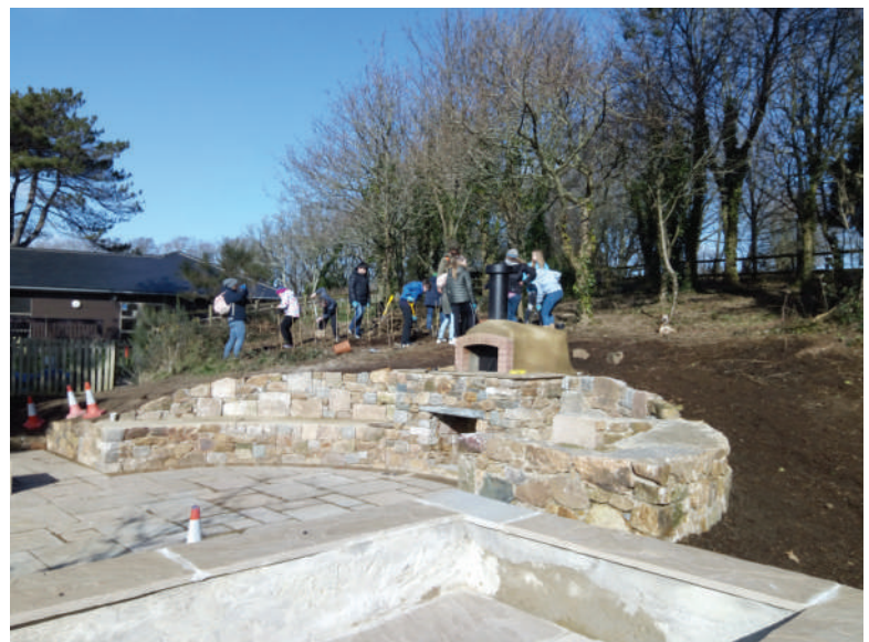
Students working on an environmental project at Crabbe

One of the most regular and long standing pieces of joint work has been the On Two Wheels programme that we deliver to Y10 students each year. This is part of Mr Heaven's Employability course. The programme covers all aspects of road safety focusing on motorcycles. Students learn to ride mopeds safely. We also have input from other agencies such as the Police, Fire Service, DVS etc. This programme is a great example of how the Youth Service and school are able to work together to access different resources and agencies and offer fantastic learning opportunities to students that we would not be able to do on our own.