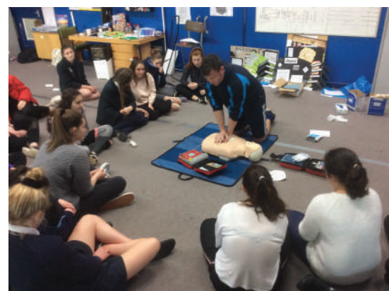
DoE Students in First Aid training

Our 28 Les Quennevais students are all currently completing their tasks in one of three categories: skill, physical and volunteering. Once these have been completed they will be verified through their on-line portal and will then begin to prepare for their final challenge – the expedition. This will involve students completing a nine mile trek across the north of the island, an over-night stay where they will have to pitch their own tents and prepare their own food around the camp fire, before setting off on their final trek the following day. All students are ready for the experience!