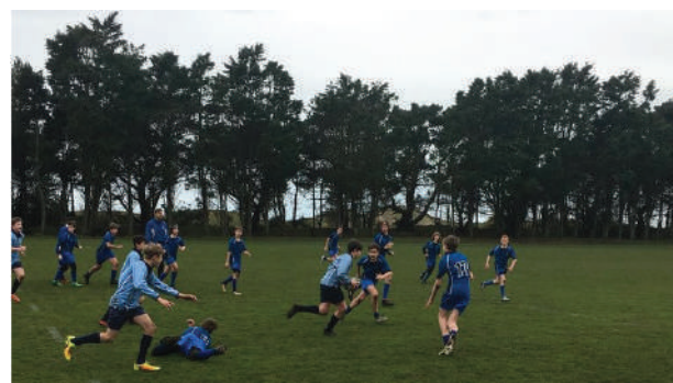
Y8 in a 40-30 thriller against De La Salle