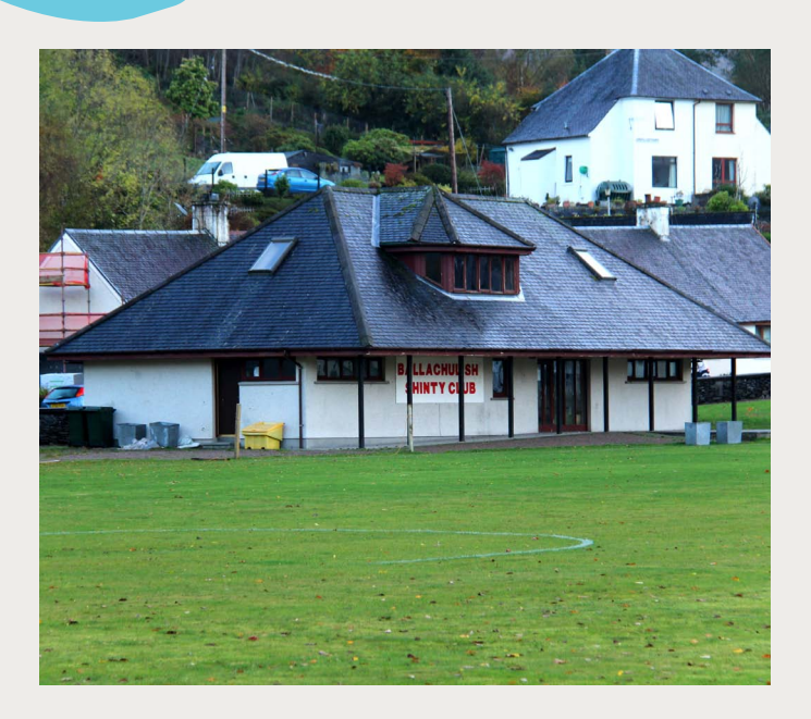
THEME 1: COMMUNITY AND RECREATIONAL FACILITIES AND ACTIVITIES