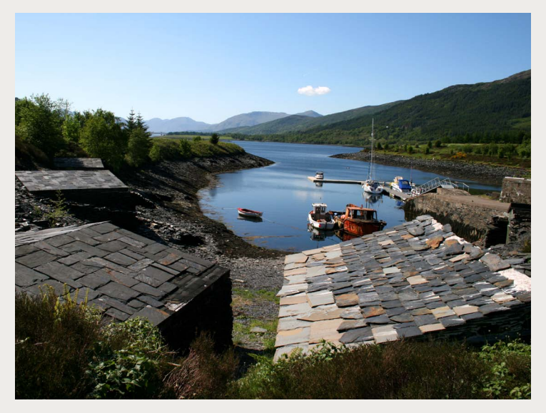
THEME 2: ENVIRONMENT AND HERITAGE

Ballachulish is well placed at the gateway to Glen Coe and beside Loch Leven to capitalise on its natural assets. There was seen to be a real opportunity to make the most of local forests, rivers, lochs, and hills to develop visitor activities and help build a sustainable community. There is the potential to develop and promote a local paths network in and around the community, as well as mountain bike trails in Brecklet Forest. The loch and waterfront was also thought to be underutilised with greater scope for promoting sailing, kayaking, fishing and other water sports and providing facilities to encourage use by locals and visitors.