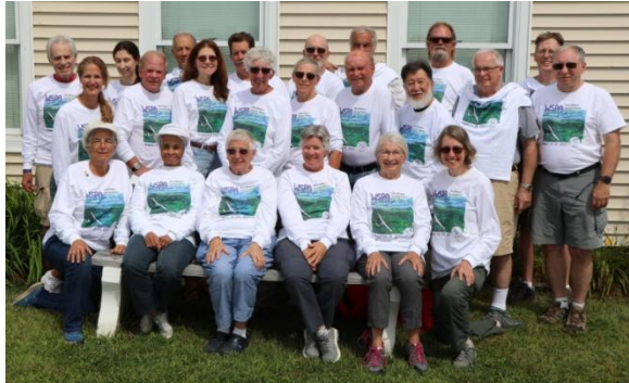
Participants and some of the volunteers at the 2021 WSPA Seminar at Springfield, VT

Thank you NESAs, GBSC, and the other clubs and volunteers who helped make this a terrific event.