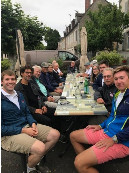
US Team dinner

We quickly learned how the contest directors wanted things done. Team Captains briefed at 1000. Pilots briefed at 1030. Gliders were weighed every day before 1100. After the pilots launched, the rest of us prepared trailers for combat readiness; fully setting up for retrieves demonstrates respect to the landout gods (hopefully reducing the chances of landing out). While the pilots flew, ground crews collected the tow ropes and wound them up. Each team brought one tow rope per pilot.