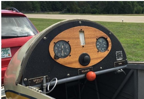
Simplicity at its best

We quickly pulled out the trailer and had the ship rigged in about 10 minutes. We had a chance to look at the incredible workmanship of the restoration, which had been completed many years ago but looked like it rolled out of the shop yesterday. The simplicity and beauty of the panel caught my eye. Low and behold, in the center of the panel was a pellet variometer.