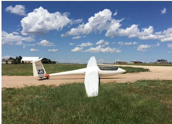
Coming soon: Z3

The BFSS BOD will keep you updated on when we can expect the "Z3" to join the fleet.