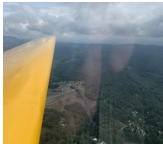
Vermont from the air