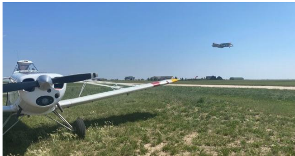
Two Stallions: The Pawnee and a P-51

It's been a pleasure to tow for the club. If you are like me and I know I am, I know we can't soar without the tow. I hope to have 500 more tows in such a short time.