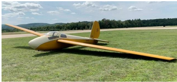
Schweizer 1-26, Serial Number 003