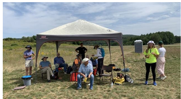
Hanging out in the shade waiting for flights

And, of course, you can't have a successful soaring event without FOOD! The clubs fed us well, with catered food at lunch and dinner, including a welcome BBQ and Friday evening banquet. The clubs provided large numbers of volunteers to help with our every need, including the instructors, towpilots, ground crew, and general "runners" who went for food and other needed items. Thank you all for your support of WSPA!