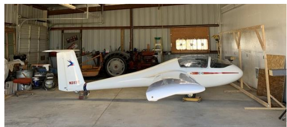
The Russia is tucked away in the cleaned up shop. Thanks Doug and Bill.