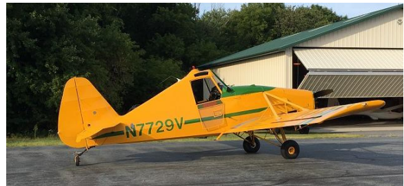
NESA's beautiful Callair towplane

After a year's postponement due to COVID-19, twenty Women's Soaring Pilots Association members and many volunteers gathered in Springfield, Vermont, for the WSPA Seminar. The event was hosted at Hartness State Airport, home of the New England Soaring Association (NESA), and the event was jointly organized with the help of the Greater Boston Soaring Club (GBSC). Other local clubs such as Post Mills, VT, and Franconia, NH, supplied volunteers, speakers, and towplanes.