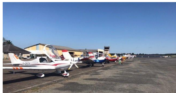
Are 12 towplanes enough? Lineup at Montlucon, France.

FRIENDLY REMINDER: STOP BEFORE THE DROP! During the landing roll, assure that the glider's wing does not scrape across the rocks on the runway edges. Before the wing drops, apply the wheel brake, but not so hard that you put the ship on its nose! "Stop before the drop!"