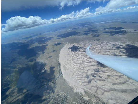
Bif over the Great Sand Dunes on his epic 777 km flight 8/23/21