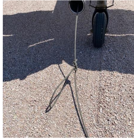
Hard release result