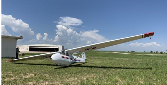
840 taking a breather