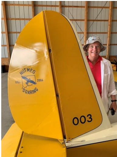
Round tails rock!