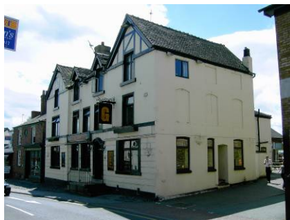
(19 May 2004 George Hotel)