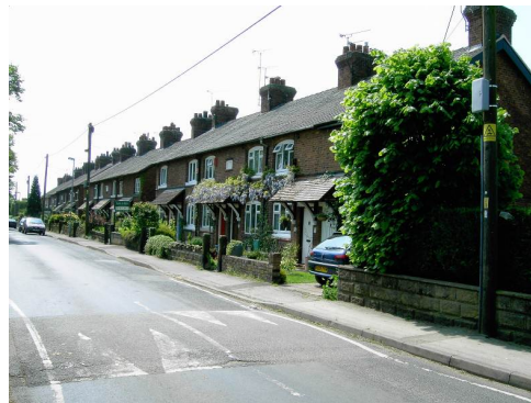
(17 May 2004)

There are various houses of various dates down this road but one group near the corner of Hassell Road and Houndings Lane are of particular interest. The first group of 2 sets of two houses were built in 1887 and are named "Stafford Terrace". In 1894 another house was added (Detached) called "Stafford Cottage" followed in 1906 by a second detached house (Also called "Stafford Cottage"). In 1911 two more houses were added followed by another detached building the date of which is not registered on the outside.