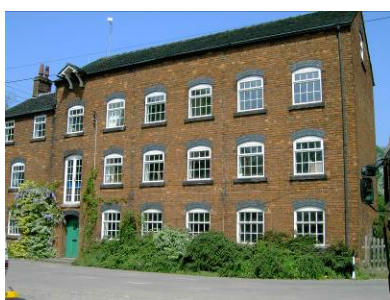
(Mill Hill Lane Cotton Mill May 2004)