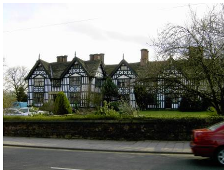
(Old Hall April 2004)

Priest in the Priest Holes and Ground floor. Two young prostitutes were possibly killed in the building and haunt the hall.