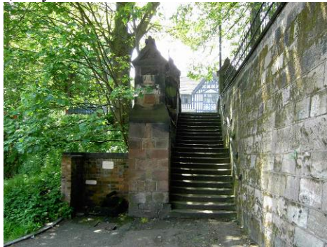
(Town Well at Front Street 17 May 2004)

The town spout was positioned opposite Bridge House at the foot of the steps on the south side of the church graveyard (on High Street). It was moved in 1876 when the church graveyard was extended. Opposite the Church on the corner of Church Street and Well Bank are two buildings called "Dingle Cottages", they were built in 1894.