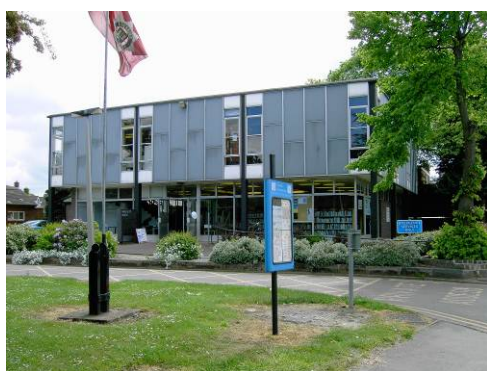
(Library 19 May 2004)