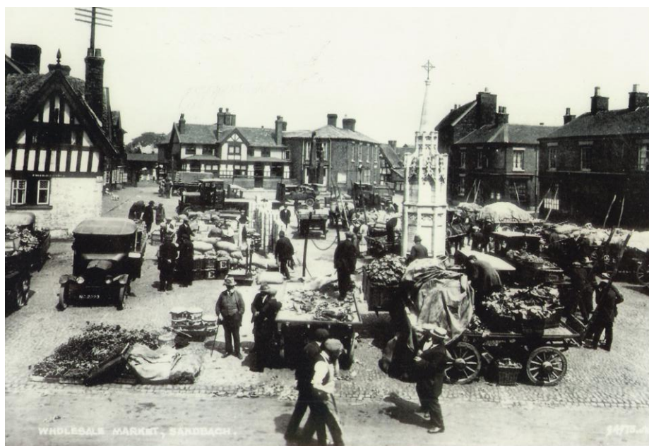
1924 Picture

In recent times by 1914 ( Kelly's directory ) a Saturday Market has been added to the inside of the Town Hall along with stalls for Thursday (Not in the original Charter).