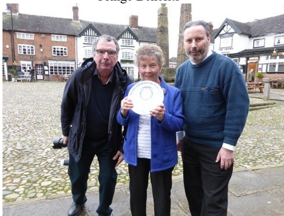
Citizens of the Years