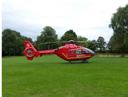
Air Ambulance drops into the Park 23 Sept 2015

On the 23 September 2015 the park had an unexpected visitor in the shape of the Northwest Air Ambulance which was attending a car crash on the Congleton Road near Tatton Drive.