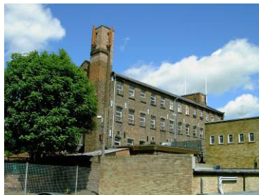
(Back of Town Mill / Curshaws 19 May 2004 / Sandbach Crosses Antiques)

Dec 2017 = Milkshakes and More (Café) CLOSED 23 Oct 2018