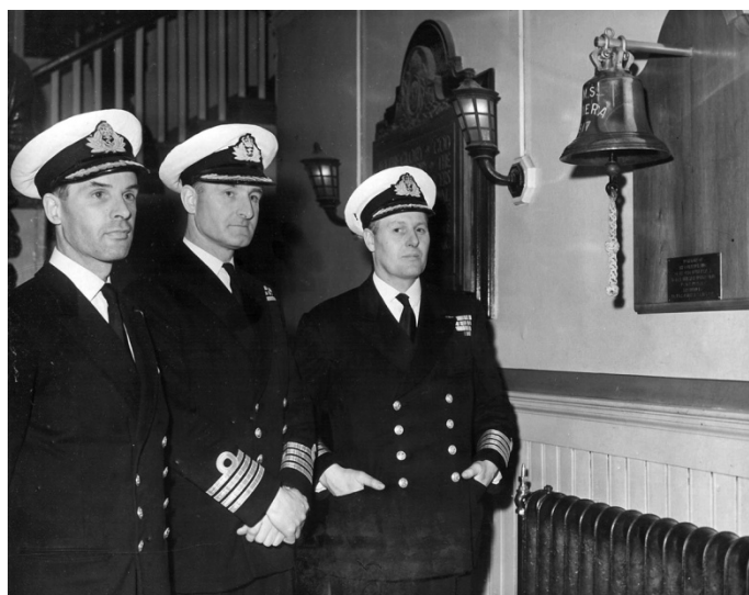
Bell seen at HMS Graham 1957

In 2017 on the 75 th anniversary of the sinking of the Vimiera the V and W Destroyers Association laid a wreath at the Clyde Royal Naval Volunteer Reserve War Memorial in Govan in memory of those 93 personnel who lost their lives on the ship. There were 127 men on board the ship when it sank of which 93 died that day with 38 surviving but 4 of these died in hospital from wounds leaving 34 survivors of the sinking.