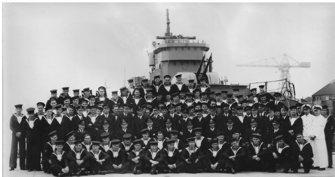
Ships Crew at the Rosyth Dockyard in Scotland in 1941

Between January and December 1941 H.M.S. Vimiera was deployed in the North Sea to defend the East Coast Convoys.