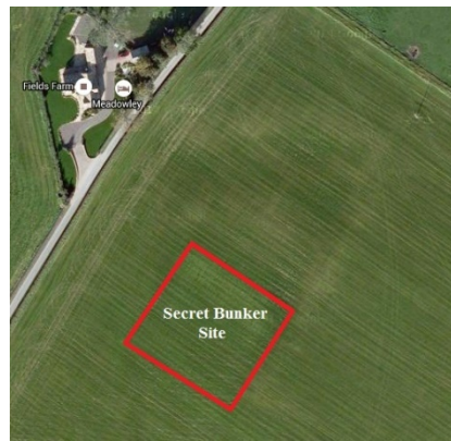
Near Fields Farm / Meadowley.

Sandbach had a Nuclear Bunker which was situated in a field just off Congleton Road and near the Junction of the M6 Motorway between Park House and Field's Fisheries. Most bunkers were built in the 1960's for men to watch and monitor the world after a nuclear blast. By the 1990's most were abandoned and the one in Sandbach was filled in in 1990 with the surface structure removed leaving a field and the structure below.