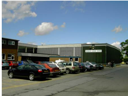
(Leisure Centre 19 May 2004)

While building took place it was discovered that one of the workmen knew how to play the bagpipes. I was at school at the time and I remember that he was persuaded to play them in school assembly. He was also heard to play the bagpipes during the daytime on the work site (See 1651).