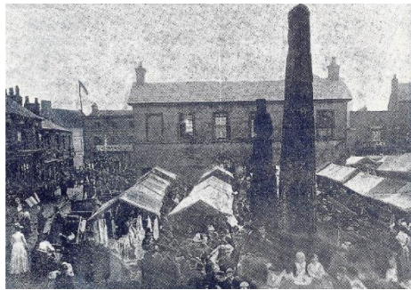
Pre 1879 Market Square Market