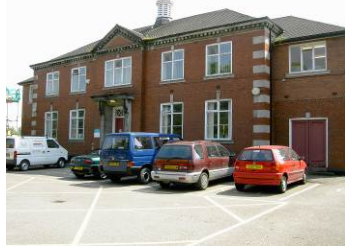
(Magistrates Court May 2004 / Demolished 2015)

On the left is a house called "The Cottage" with its own stables and outbuildings. For many years until 2004 it was part of a Doctors surgery, but it probably started life in 1787 as a vicarage and was the property of Lord Crewe. This building was demolished in 1958 (Check Info) .