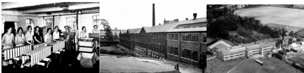
Brook Mill