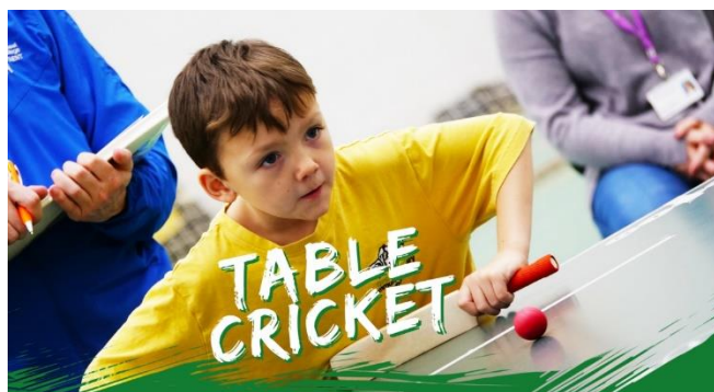
Table cricket is an adapted version of cricket, played on a table tennis table and specially designed to give young people with a disability the chance to play and compete in the sport we all love. This year Yorkshire has delivered the programme to over 50 SEND schools and community centres supporting close to 2,000 participants county wide.