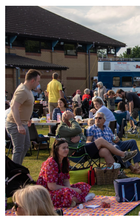
More photos from the Queen's Platin