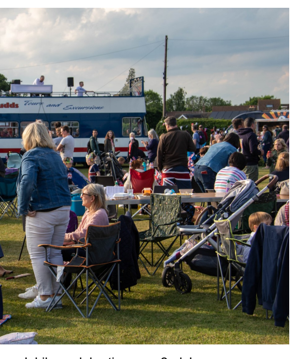
um Jubilee celebrations on 2nd June.