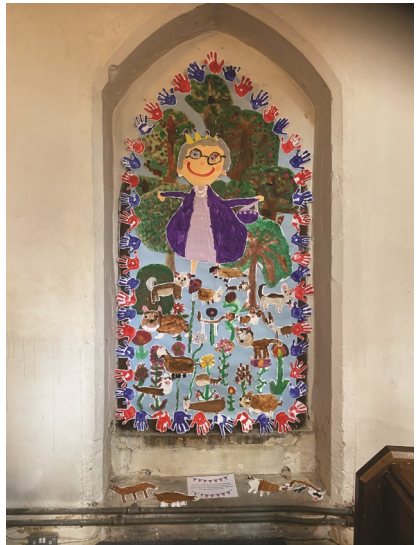
Children's picture north door

There are some special services and events coming up this autumn. Our Harvest celebrations begin with a Harvest Coffee Morning at the church on Saturday 24 September, 10 am to midday, in aid of the St Ives Foodbank and church funds; on Sunday 25th is our familyfriendly Harvest Thanksgiving Service at 9.30 am, followed by refreshments and sale of the donated produce, in aid of St Ives Foodbank. On 1 October we have the welcome return of the Wandering Minstrels and their entertaining programme of excerpts from Gilbert & Sullivan – 7.30 pm at the church. For more details, see the advertisement in this copy of The Villager (page 34). On 6 November at 3 pm we shall be holding our annual All Souls Service, at which we commemorate the lives of loved ones who have passed away.