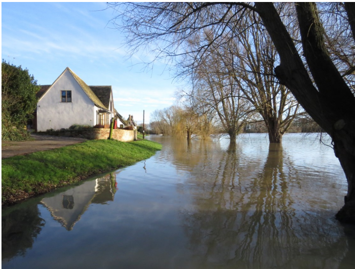
Christmas Day 2020. Holywell Front and the Pike and Eel car park.