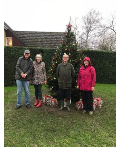
Christmas Tree Committee members

The Parish Council extends their thanks to all of those involved.