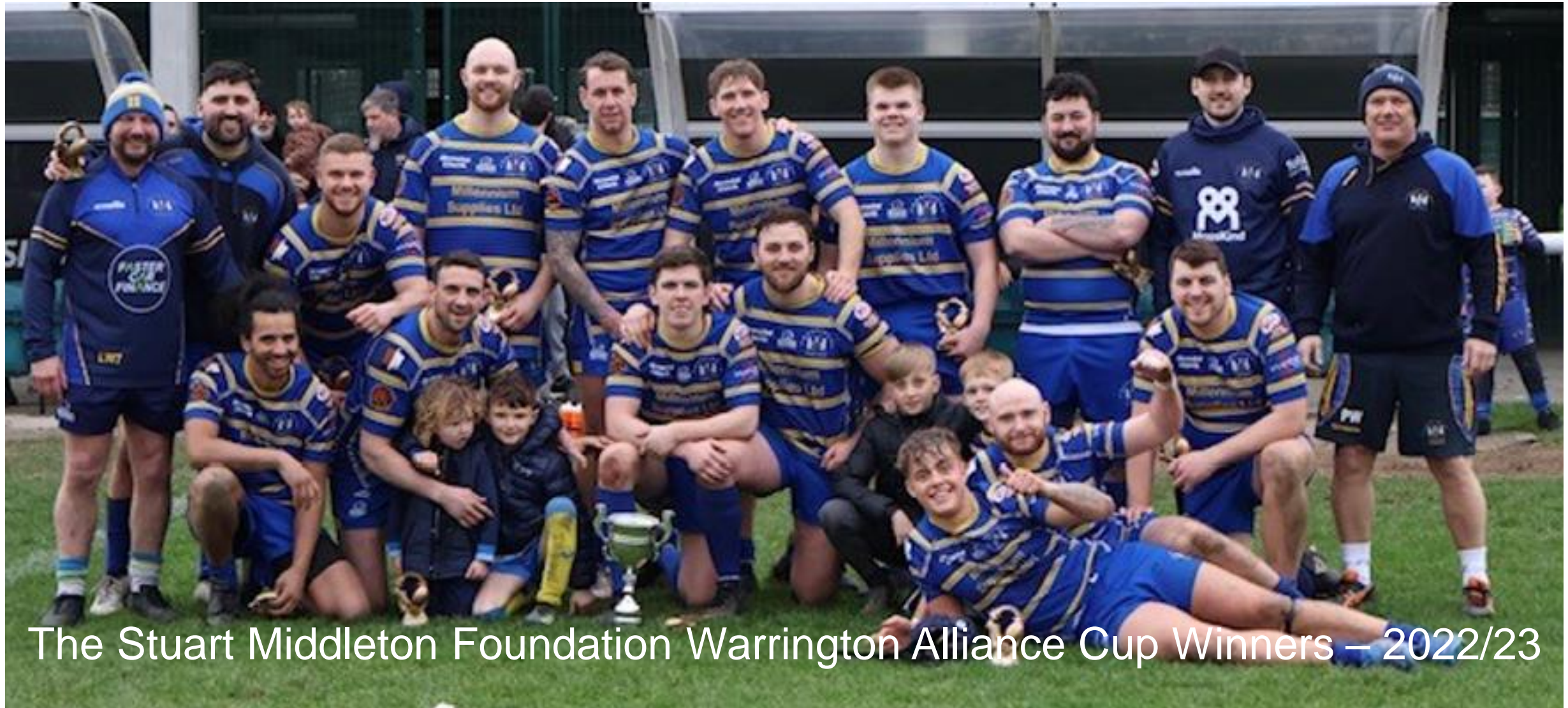
The Stuart Middleton Foundation Warrington Alliance Cup Winners – 2022/23