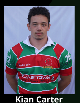
Centre The Fingerpost Pelsall