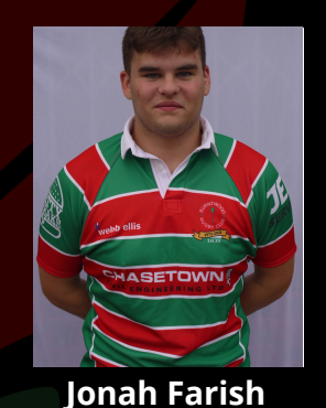
Back Row Player requires sponsor