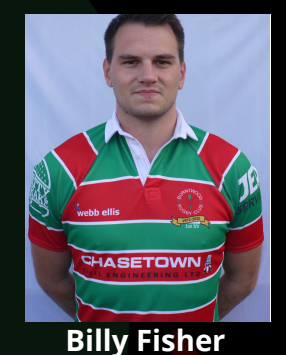
Centre Player requires sponsor