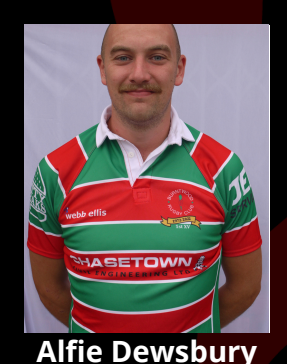
Back Row Ye Olde Windmill Inn