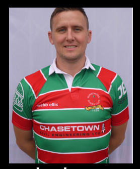
lan Jones Centre <u>Player reguires</u> sponsor