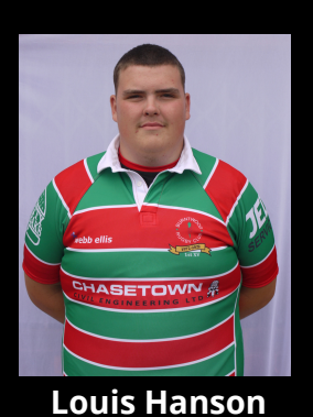
Prop Player requires sponsor