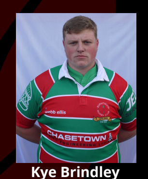
Prop Player requires sponsor