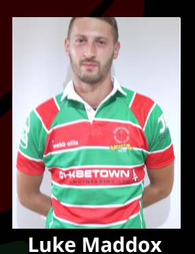
Full Back Player requires sponsor