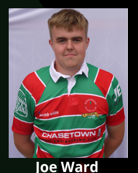
Second Row Player requires sponsor