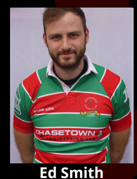
Winger Player requires sponsor