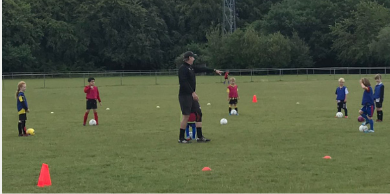
The U6 squad return to training .....