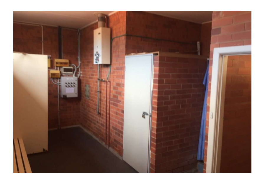
Bathrooms before and after the renovations after the renovation