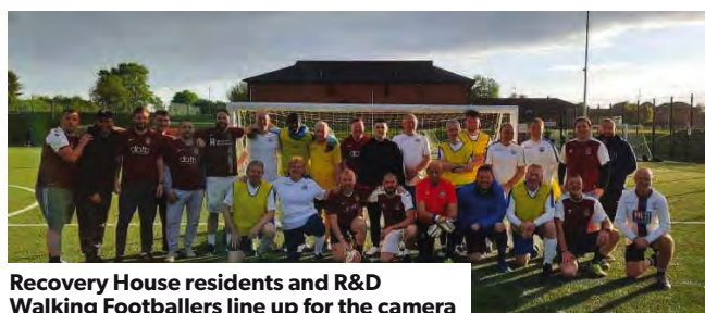
Recovery House residents and R&D Walking Footballers line up for the camera

The Recovery House Project started in 2015 for men recovering from substance addiction, with each resident going through a 6-month