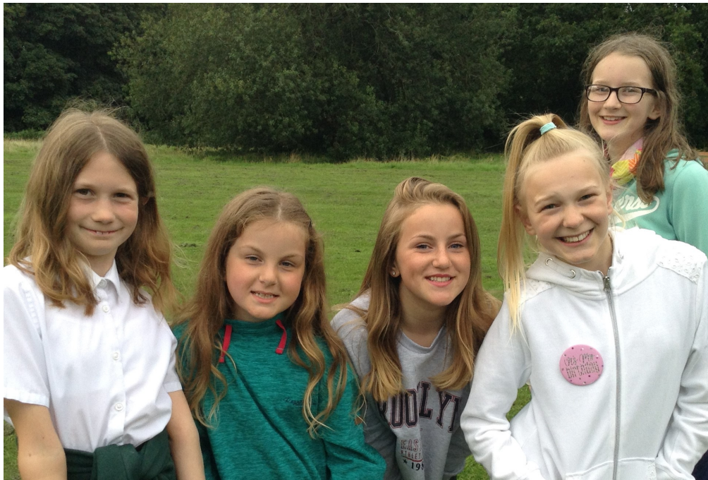
Some of our young choristers also eager to get under way.