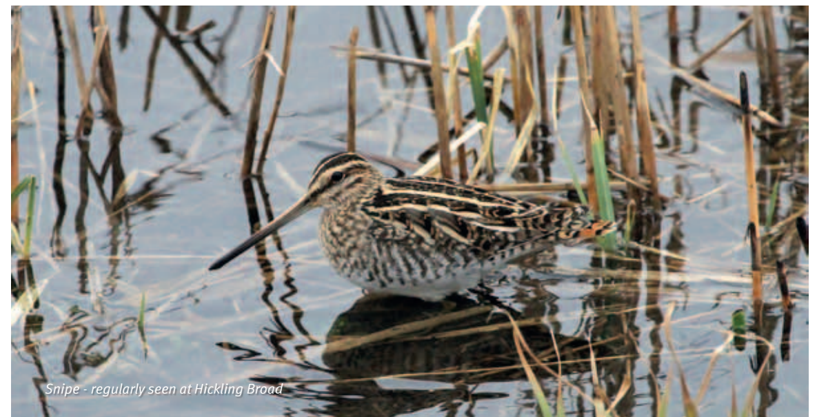
Snipe - regularly seen at Hickling Broad