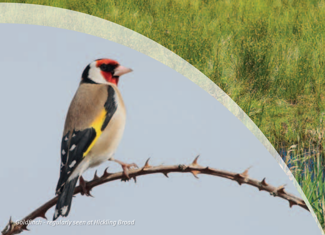
Goldfinch - regularly seen at Hickling Broad