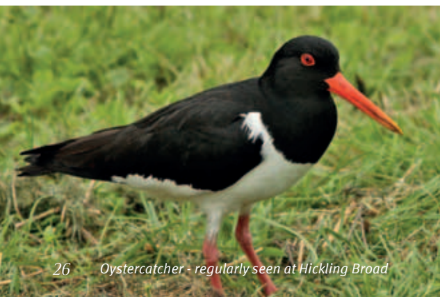
26 Oystercatcher - regularly seen at Hickling Broad