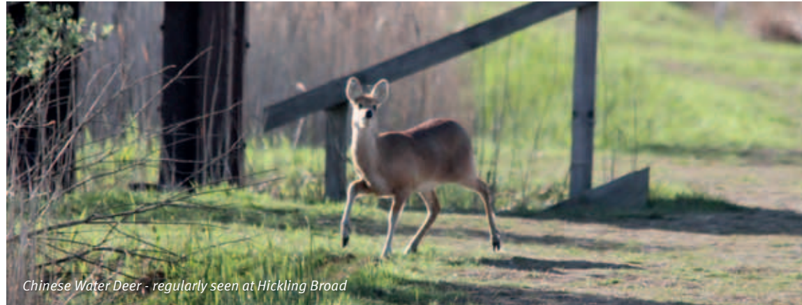
Chinese Water Deer - regularly seen at Hickling Broad

The property is sold subject to and with the benefit of all existing rights, including rights of way, whether public or private, light, support, drainage, water and electricity supplies and other rights, easements, quasi-easements, and all wayleaves whether or not referred to in these particulars.