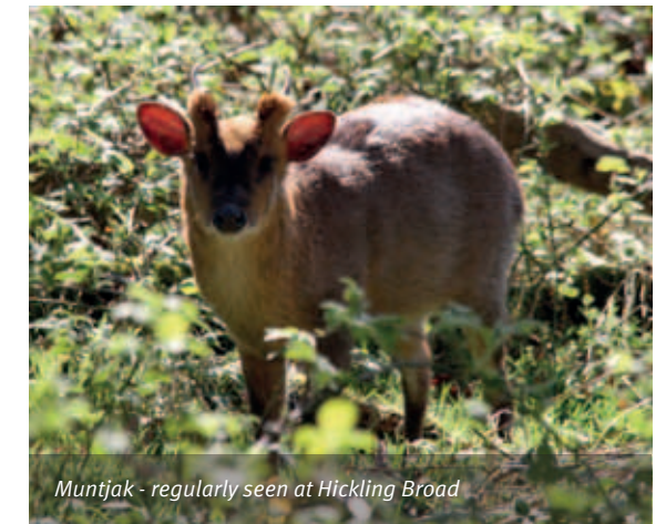
Muntjak - regularly seen at Hickling Broad