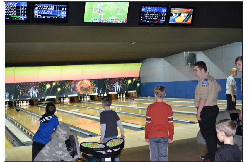
A Busy Sunday evening down at Hawley Lanes