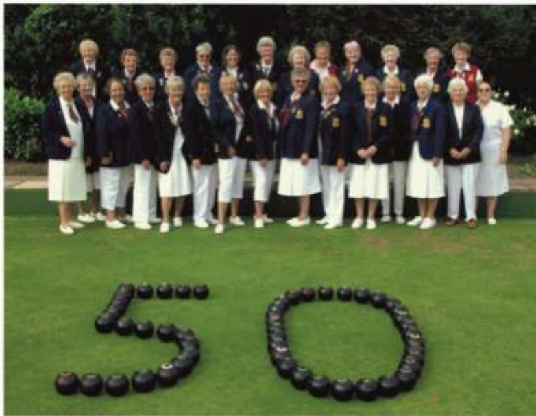
Woking Park Ladies –Celebrating the 50th Anniversary of the Ladies Section.1956- 2006