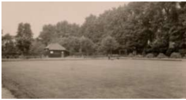
This shows the semi rural aspect of Woking Park as it was in the 1920's The Pavilion was erected in 1919