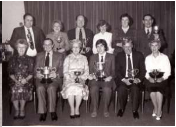
The Winning Team Woking Review Cup 1983