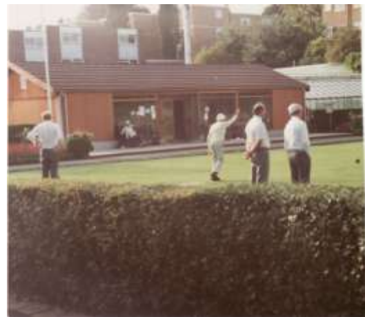
A view of the Clubhouse probably 1980's Note change in background showing the local development