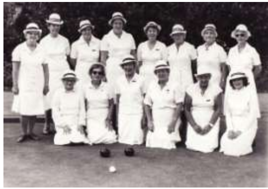
Woking Park Ladies