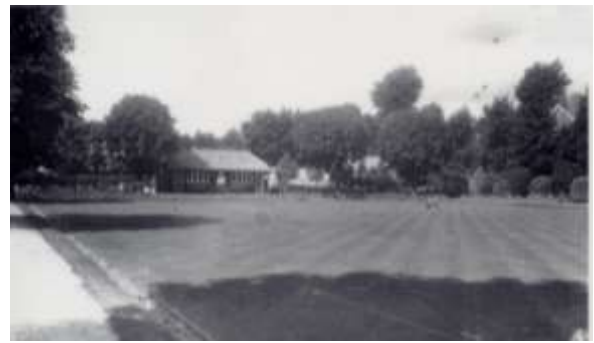
This is showing the newly extended Pavilion— Probably taken in the mid 1930's