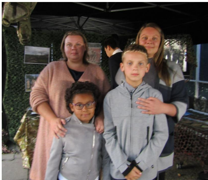
Families enjoying Haileybury Turnford's 2018 Open Evening