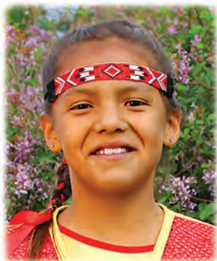
This beaded headband was made by St. Joseph's students in Native American Studies class.

The Jingle Dress Dance has been around for approximately 100 years. Tribes of the Plains borrowed the dance from the Chippewa tribes of the Great Lakes region. This style of dance is very popular among young female dancers. You can hear these dancers coming from a distance as their many metal cones make a unique jingle sound.