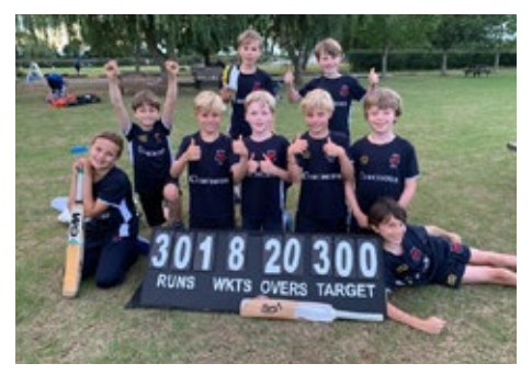
Esher Cricket Club Annual Report and Accounts 2020