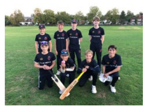
Winners - Esher 8-a-side Tournament