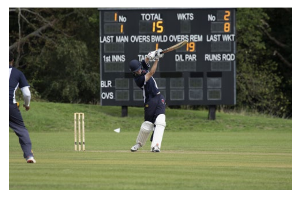
Esher Cricket Club Annual Report and Accounts 2020