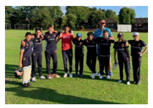
Under 11s winning the Ashtead 8-a-side tournament