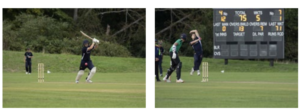
Senior Academy in action