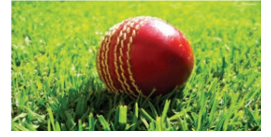
ESHER CC END OF SEASON BALL To be held at Imber Court. More details to follow