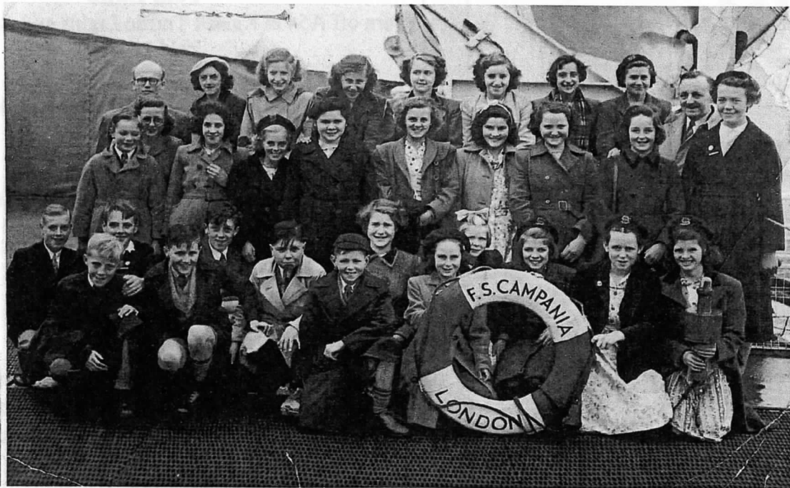
How many can you identify?