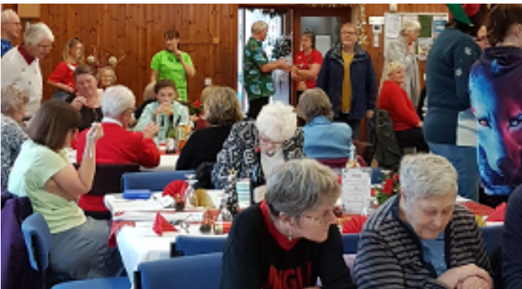
Pictures from the Christmas With Friends event held at Fleckney Village Hall on the 23rd December 2018