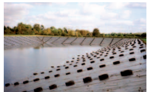
Left Moatlands Golf Club Kent