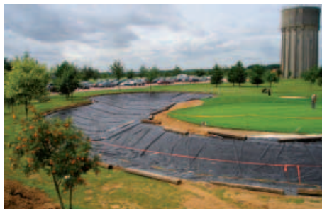
Right Celtic Manor Resort South Wales