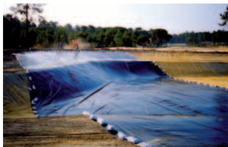
Right Frilford Heath Golf Club Oxfordshire