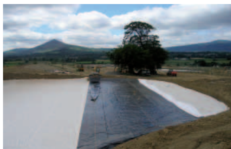
Right Killarney Golf & Fishing Club Ireland