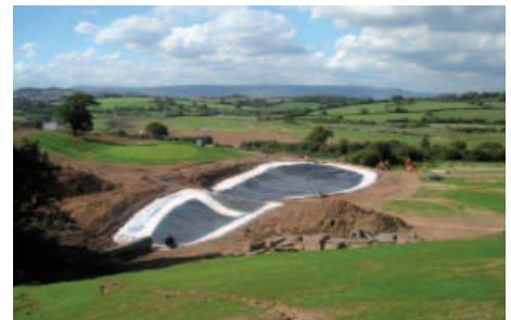
Left Enville Golf Club Staffordshire