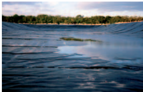
Right Discovery Bay Golf Club China