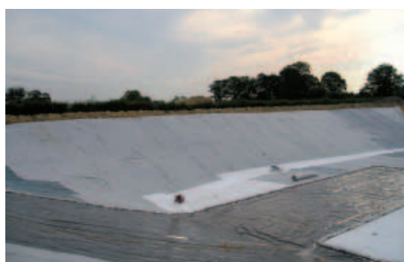
Right The Oxfordshire Golf Club Oxfordshire