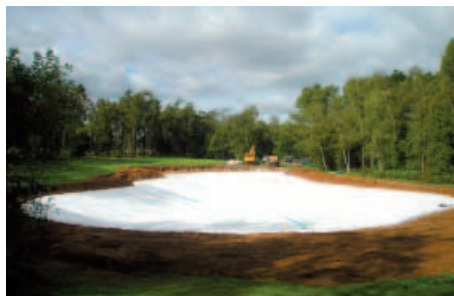
Right High Legh Park Golf Club Cheshire