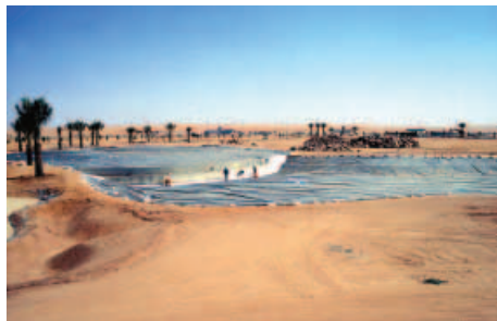
Right Brunnthal Golf Course Germany