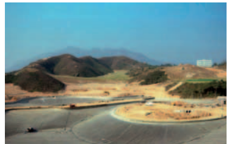
Left Dun Laoghaire Golf Course Ireland