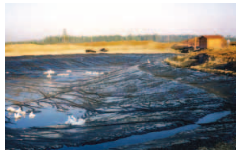
Left Abaco Golf Project Bahamas