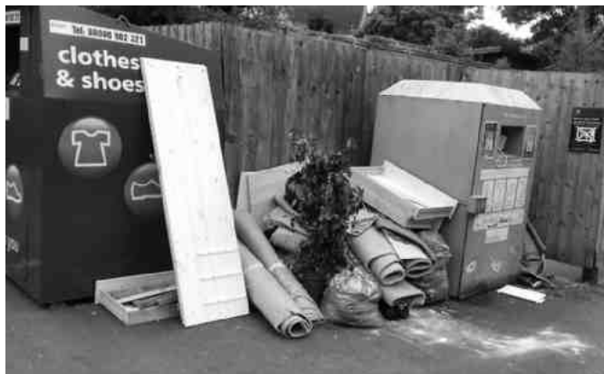
'Recycling' efforts at the New Street car park

After all Chipping Norton's bin regime changes last year – how are we doing? First, the good news. A 2017 national report of 350 English local authorities shows South