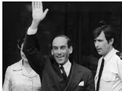
Jeremy Thorpe celebrates his acquittal in 1979