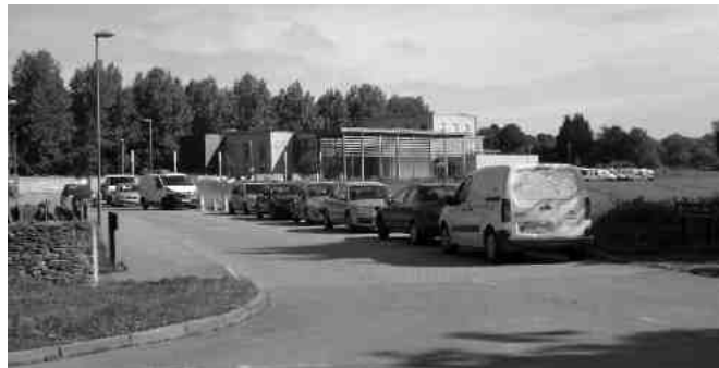
Parking along Russell Way leading to the Health Centre

Peak activity at the two London Road construction sites has increased parking along Trinity Road, Russell Way and London Road. The 'perfect storm' sees both the McCarthy & Stone complex (at the back) and the new Retail site, at the front, at full construction activity – continuing for the next few months. With London Road parking now restricted, the combination of school drop-offs, plus parking for workers' cars and contractors' vans seems to be causing potentially dangerous parking – and police were involved in early June to help sort things. At Russell Way, the busy entrance for hospital and health centre, parking was causing one way traffic – with difficulties for Russell Way users to get on and off the main road.