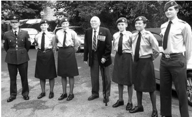
The British Legion and the ATC were represented at the unveiling ceremony at the Town Cemetery in May

As part of commemorations to mark the Centenary of the end of the First World War, the Royal British Legion Chipping Norton branch, with the Armed Forces Trust, commissioned a memorial board for the town cemetery. Based on research