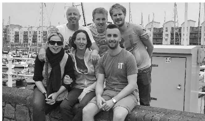
The Whistlers Team – finally made it to Jersey