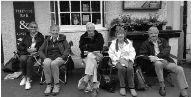
Earlybird bookers snapped queuing from 7am on the first day of Panto sales

Mummies, pyramids and a daft genie – Tickets for this year's panto Aladdin are now on sale. Box Office 642350. www.chippingnortontheatre.com .