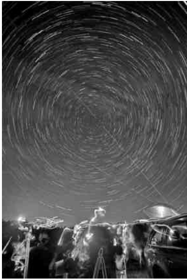
40 min star trail exposure showing rotation of the Earth, laser pointers and moving lights by the telescopes