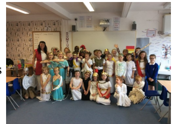
Oak class on Greek Day.

Year Four: On Tuesday 10th October Year Four all took part in Greek Day. Over the course of Term One Oak and Maple Classes have been looking at who the Greeks were, where they lived and what their everyday life was like. We had great fun on Greek Day