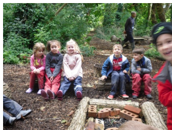
Enjoying Forest School.

Our final thanks are sent out to the PTA and all the parents and families that attend their numerous fundraising events, for providing the funds for these amazing gifts, they are already being used and are making our children's experiences richer, watch this space for more adventures!