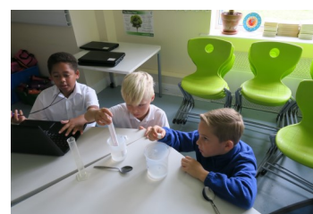
Finding different ways of recording results.

All in all, a very productive day was had with some excellent speaking and listening taking place.