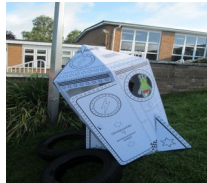
The space craft!

thinking of different ways to fix the spaceship, and help the aliens return home. We have enjoyed communicating with the aliens and have written some fantastic letters which the aliens have enjoyed responding to.