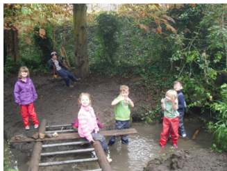
At Forest School.