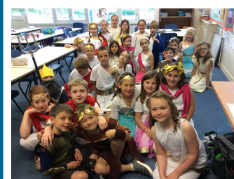
Maple Class on Greek Day.

making pots out of clay, taking part in the Olympics and tasting some delicious Greek food, although not everyone liked it! The costumes looked amazing; thank you to all parents and carers who helped to make Year Four look so brilliant!