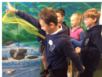
Fun at Oxford Fire Station.

Year Six: As part of our “999 Emergency!” topic, we have been learning about how to stay safe and lead a healthy lifestyle. We enjoyed our visit to Oxford Fire Station, where we visited different rooms where different scenarios had been set up, including discovering a casualty in the road, finding dangers in the home, learning about the recovery position and internet safety. We had to work together to discuss and demonstrate how overcome the