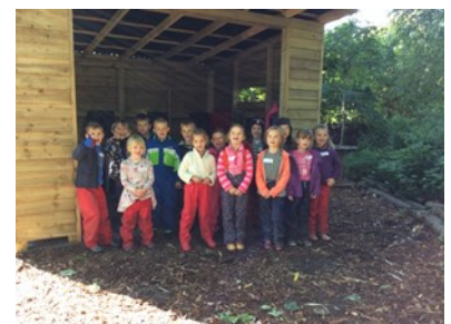
Children enjoying the new shelter.