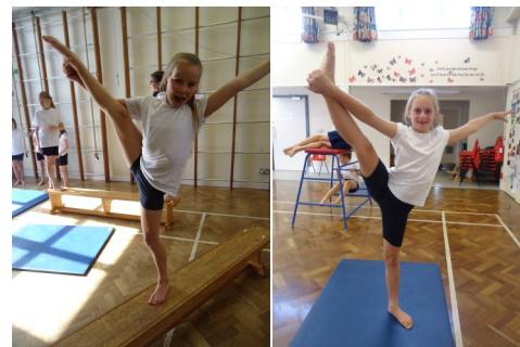
Year Fives demonstrating their gymnastics moves.

Year Five: Year Five have been performing some interesting science observations this term, including some fun with fire - we used tea-lights to safely try heating and burning different materials. We have also