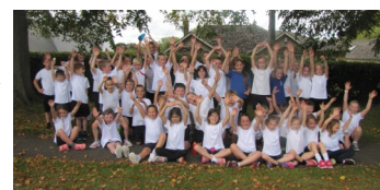
All of our Cross Country competitors.

Cross Country Qualifiers: On 22nd September Years Three, Four, Five and Six boys and girls from Charlton competed against other local primary schools at Wantage Park. All of our Group A teams made it through to the next stage.