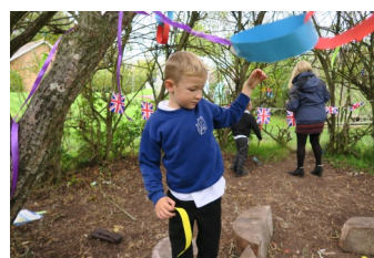
Decorating the willow domes.