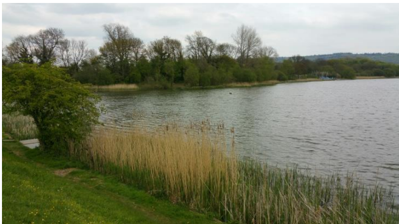
Weston Turville lake – a location for the installation of four new fishing platforms