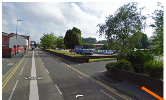
Access from Wetmore Road

Turn off into The Workout (formerly Fitness First) car park and head to the far left corner. Cross the bridge and follow the track past the bowling green