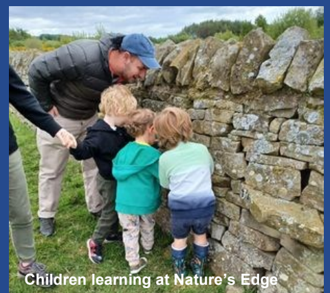
Children learning at Nature's Edge

It's down to each individual Burnhope Parish resident to look into these and decide for themselves. You'll find information inside.