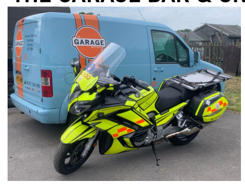
Tiger from Northumbria Blood Bikes dropped in to explain why the blood bikers love the Garage Bar & Grille.

The Garage Bar & Grille has been an incredible support to our fundraising efforts for Northumbria Blood Bikes.