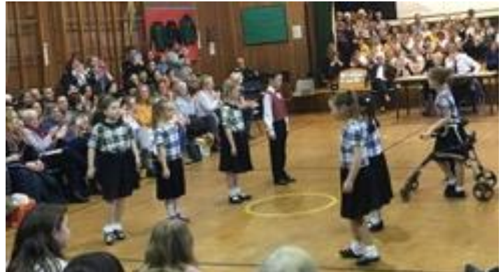
Brownhall Primary pupils