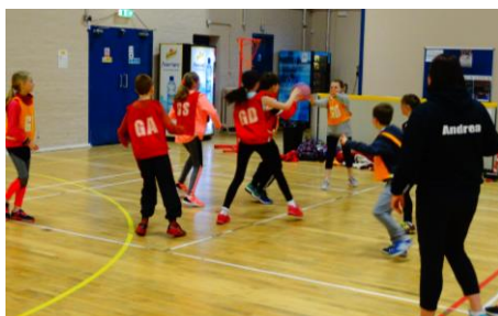
Fun 5z Netball