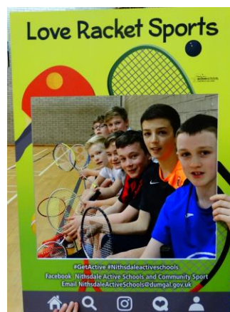
Selfie Board Fun!!