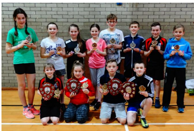
Regional Winners 2017