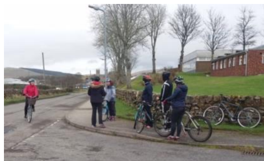
Bikeability CTA training at Sanquhar

Bikeability Training - Bikeability provides our children with the necessary skills to keep active and ride confidently on today's roads. We are no longer in the privileged position where Road Safety officers can deliver such a cycle training programme for us and for several years we have relied upon a mixture of volunteer and school staff input. We held 2 training courses for school and community staff in March.