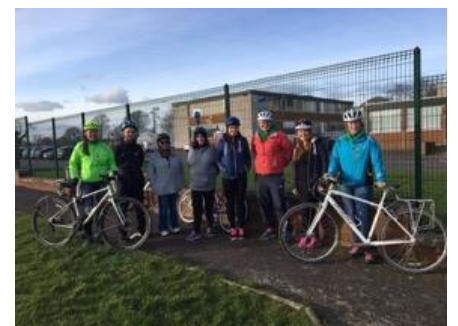
At Maxwelltown High School