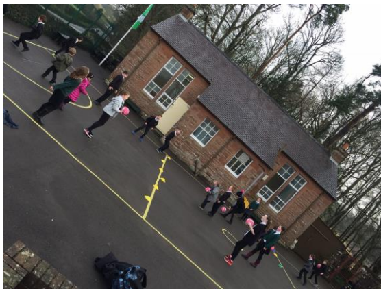
Dodgeball breakfast club at Duncow

Various breakfast and lunch clubs have been running this term from jogging, dance, badminton, netball and dodgeball. We currently have a fantastic team of community sport coaches who can cater to pretty much any need – ask your Active Schools & Community Sport Officer for more information.