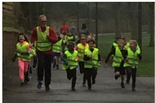
Lunchtime jogging club at St Michael's (Dock Park)