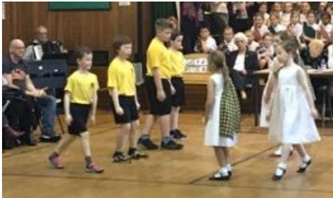
Cargenbridge Primary Pupils