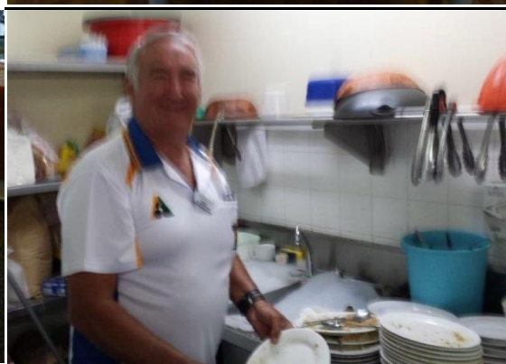
Our volunteers were everywhere