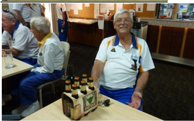
Winners are grinners