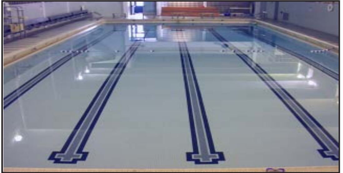
CENTRES OF EXCELLENCE: The BOA will use regional pools for UK training

I say the tragedy is that people have not realised that we, as a sport, would be much stronger if we acted together.