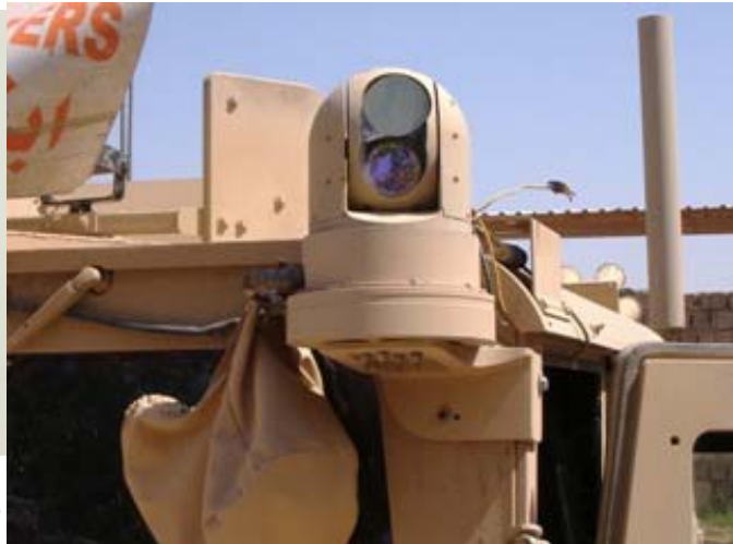
Picture from Iraq of Meeker gear at work, the first picture is of Meeker's camera isolation device, a sight more familiar under LE helicopters the second picture is one of the isolator's on a Humvee road vehicle in Iraq (the infrared camera is sitting on it).