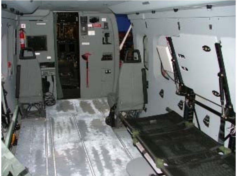
The latest example of the stacking system entering service is that fitted to the CHC Sikorsky S-92 on display at this years HAI Heli-Expo in Orlando.

many other types of medical stretchers. The SLS is engineered to withstand 16G forward and 20G down loads, to meet or exceed any aircraft requirement. Total system weight is less than 52 kgs and can be deployed in less than 15 minutes without the use of tools. Aircraft that are currently flying the SLS include the Sikorsky S-92, UH-70, Casa 212, KC135 and C-40C.