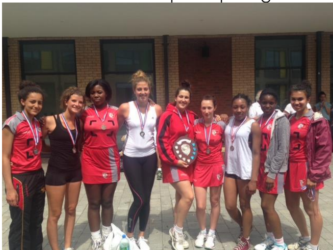
Winners Linden Netball Club pictured above

Linden, Sutton Royals, Alfabetts, Flames, Lyndon Centre, Henley, Barr Beacon & Copsewood Diamonds. Well done to all the teams for participating!