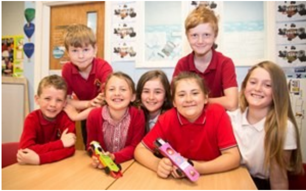
The two St Mary's Nercwys VAP School teams, 'Light Speed' and 'Jungle Racers' who represented Flintshire at the final of the