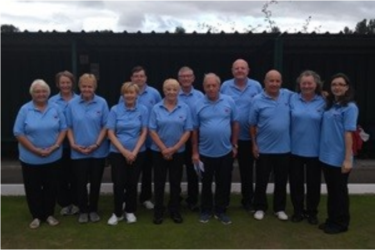
FMBL consolation cup final team 2018