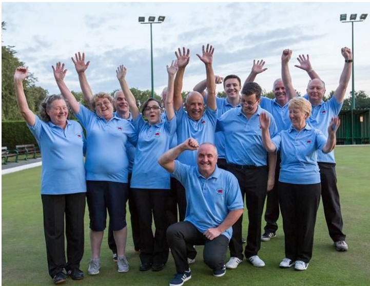
Nercwys 'B' Division 5 cup winners 2018