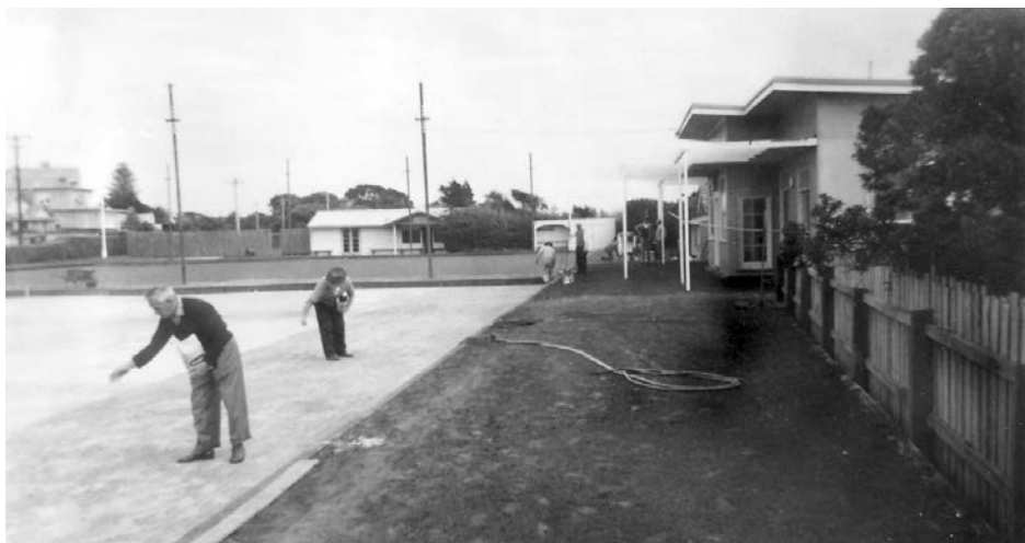
Developing a new green at a working bee in 1957 (note the old croquet clubhouse in the background, the croquet green which became Green No. 3 is behind it). One of the many undertaken by members over the years to help improve the facilities.