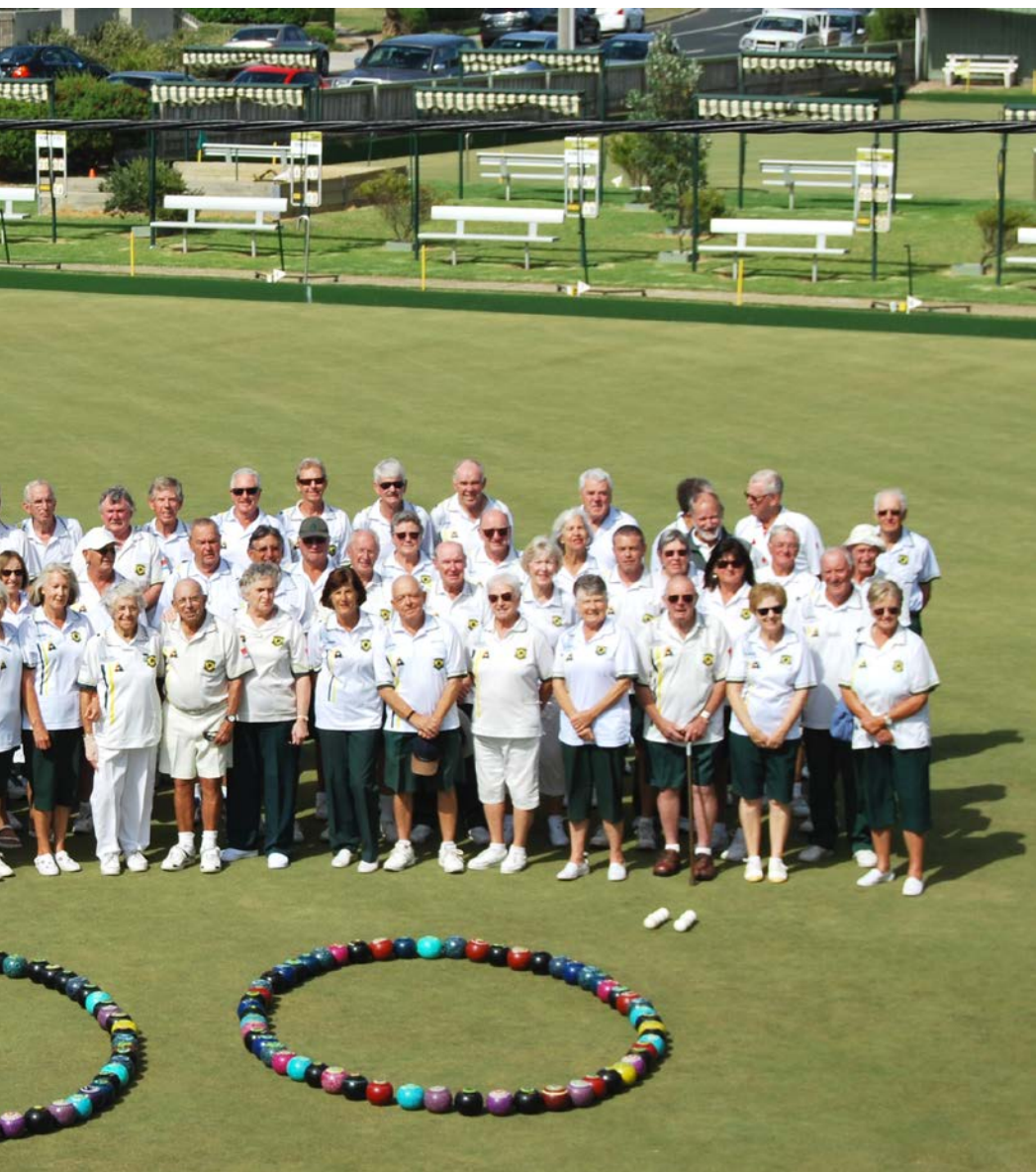
early so that this photo could be included here (Saturday March 25th, 2017).