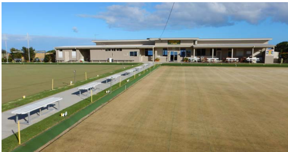
An outside view of the clubrooms as they appear today.