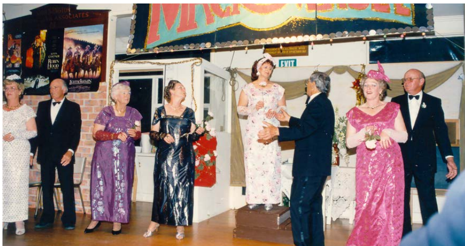
Revue/Concert - One of the social functions that were popular for many years at the club took the form of a concert where people performed acts of all kinds. Someone told us that these were so popular that, sometimes, they were spread over two evenings.