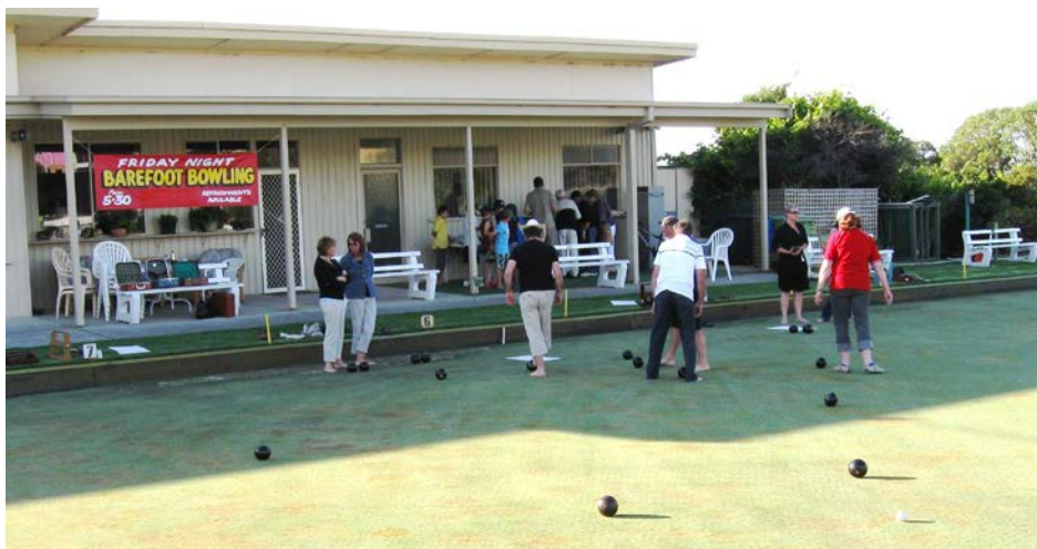
Barefoot bowls - fun for the participants, great advertising for the club and a wonderful source of income (but a considerable amount of hard work for somebody most Friday nights during the Daylight Savings period).