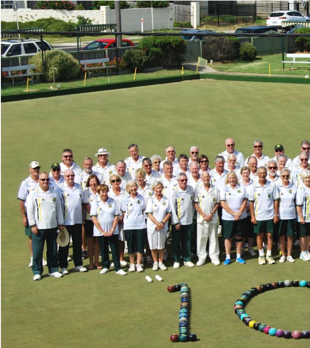
Seventy nine members of the Mornington Bowls Club celebrating a little e