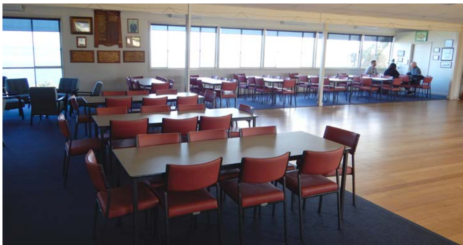
An inside view of the clubrooms as they appear today.