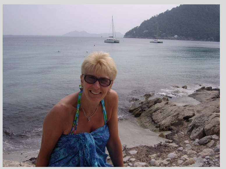
Retirement? What Retirement?