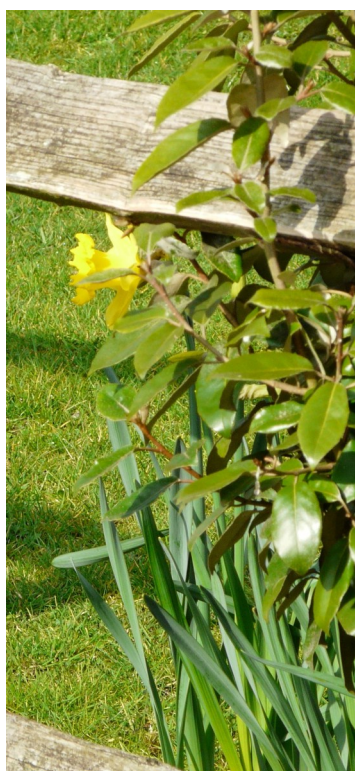
SPRING POKES ITS HEAD ROUND THE CORNER