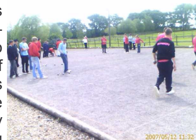
Espoirs in action at Crondall