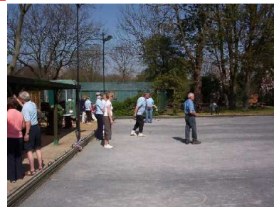
Fantastic "Summer" weather at the Hartley May Day Triples