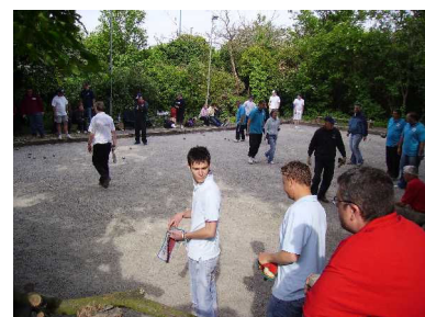
Qualifier at Plough & Chequers started off warm