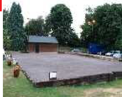
The George Terrain

As with most clubs most new players come through word of mouth and introductions from existing members, however, we also advertise in the pub itself, at other locations in the village and in local publications.