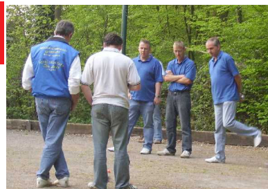
The Rejects vs MNR in the final at the first Regional of 2007, Lordswood, 22 April

One team player interviewed at Lordswood said "we have excellent organisation and a top flight umpire, why are a few players allowed to spoil the event for the rest? I have played for 45 minutes and it is 3pm!"