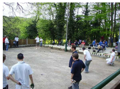
Play on the new improved Lordswood terrains