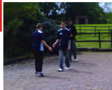
Kent Juniors at Crondall