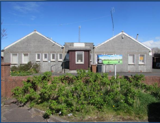
Top Row – Ardrossan Youth Centre, Ardrossan Library, Park Church