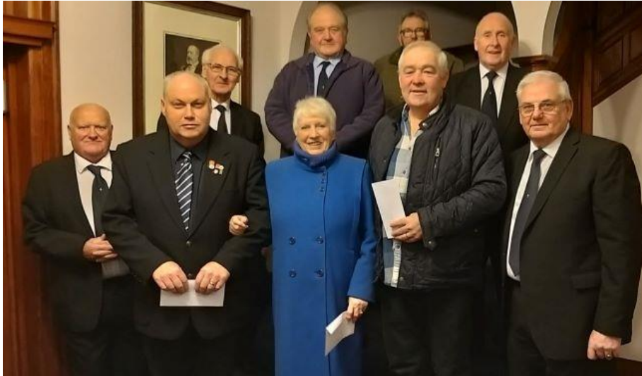
Representatives for the Senior Citizens