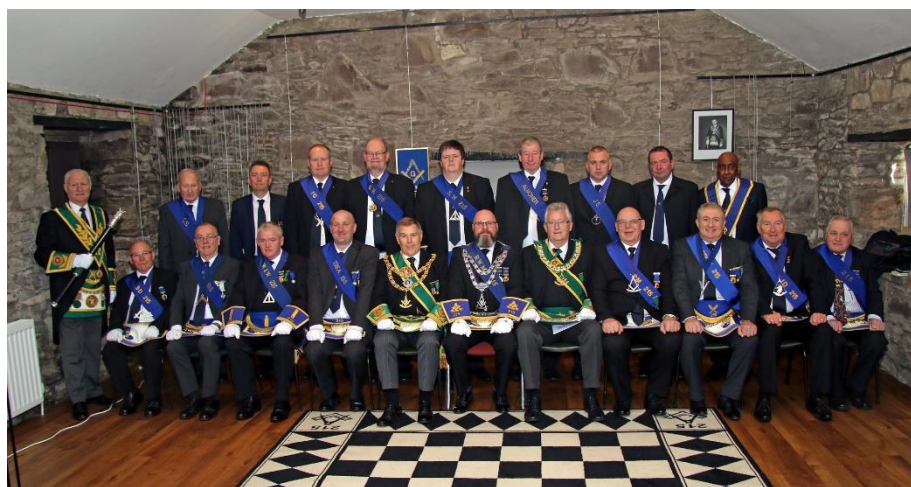
The Brethren of Lodge St Andrew in their new home.

First thing next morning, it was a drive from Midlothian to Strathaven in Lanarkshire Middle Ward where I Consecrated a new Masonic Lodge building. The building, the Old Grannery, part of the Strathaven Town Mill complex became available but was in a very poor condition. However, the Brethren of Lodge St Andrew 215 rose to the occasion and have worked extremely hard to turn the room into a magnificent wee Lodge Room. They should be exceedingly proud of their achievement.