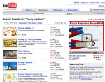
Search result placement

Drive engagement and awareness with high-profile placements on YouTube's Search Results pages