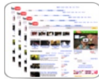
Run of site